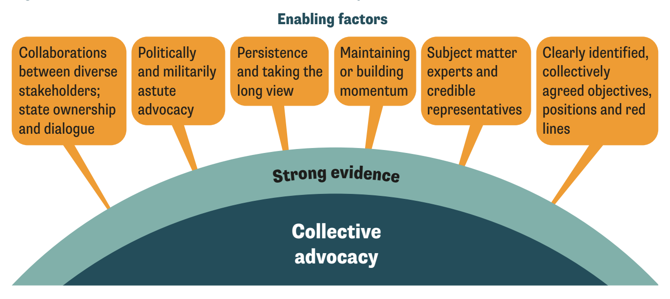
Figure ES1 Factors that have facilitated collective advocacy

It goes without saying that reaching out to and generating support among a diverse group of states is essential to bring visibility and leadership to the advocacy initiative. In particular, identifying states that have high interest and high alignment with the objectives of the networks and engaging these states early is key. For both EWIPA and CAAC, state champions have been critical. For the EWIPA agenda, engaging interested states such as Mozambique and Chile led to regional conferences in Maputo and Santiago that were instrumental for regional blocs to develop a common position and foster buy-in. For the CAAC agenda, member states have acted as guardians of the CAAC mandate. However, the need for more representative engagement, and lack of diversity of state champions – including from the Global South – has been described as one of the main weaknesses, but so pivotal, that commentators to the CAAC agenda believe the agenda 'won't progress without it'.