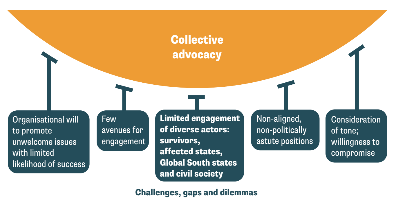
Figure 5 Factors that have hindered collective advocacy

As identified, coherence in messaging and advocacy objectives is critical. Diverse, non-aligned and sometimes competing positions can compromise the outcome sought and send mixed and confusing messages to advocacy targets. Without aligned and politically astute advocacy positions, there are also risks that advocacy positions can play into political interests. Humanitarian organisations often call for the IHL to be upheld during the conduct of hostilities, but states often use international law to their benefit. Regarding the use of EWIPA, some militarily strong states took the position that the IHL is adequate and disagreed with the need for further norms. Therefore, organisations calling for IHL compliance in areas where EWIPA are used can risk undermining the coherence of the position of EWIPA agenda advocates. It can allow states to play organisations off against each other, asserting that no action is required because the IHL is sufficient.