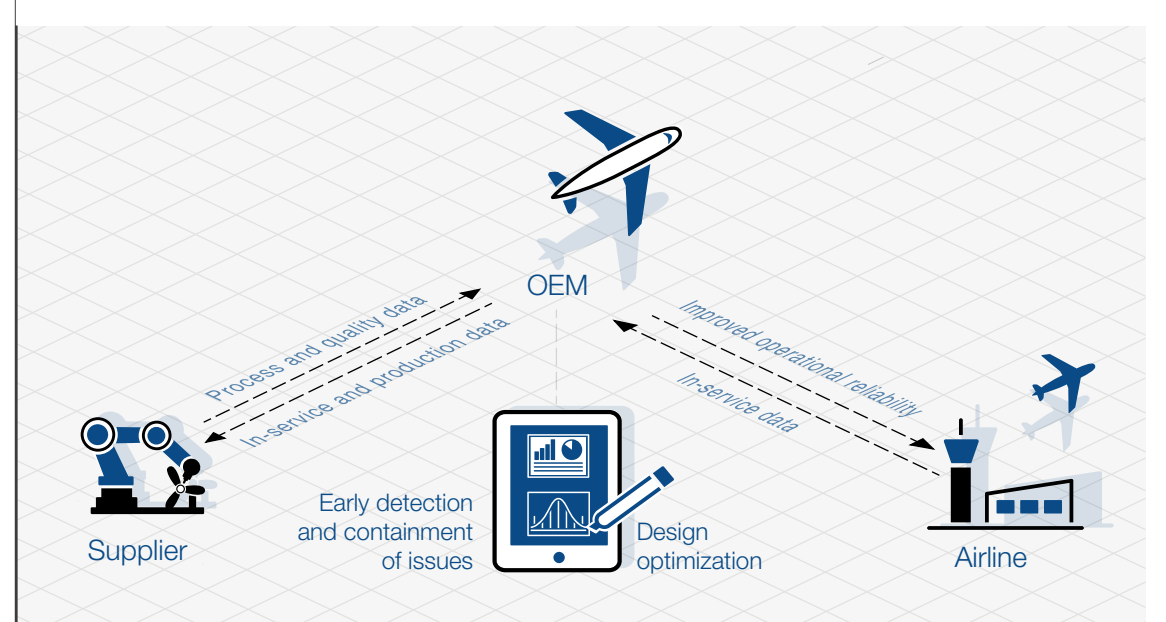
FIGURE 2 Example of improved product quality and reliability based on in-service data

Some applications can be used with a company's internal data only (such as quality data analysis on a specific production process), while many other applications that improve the customer experience require data flows across company boundaries. Airbus provides an advanced example of how manufacturers can use in-service data shared by customers to improve the quality and operational reliability of their products (Figure 2).