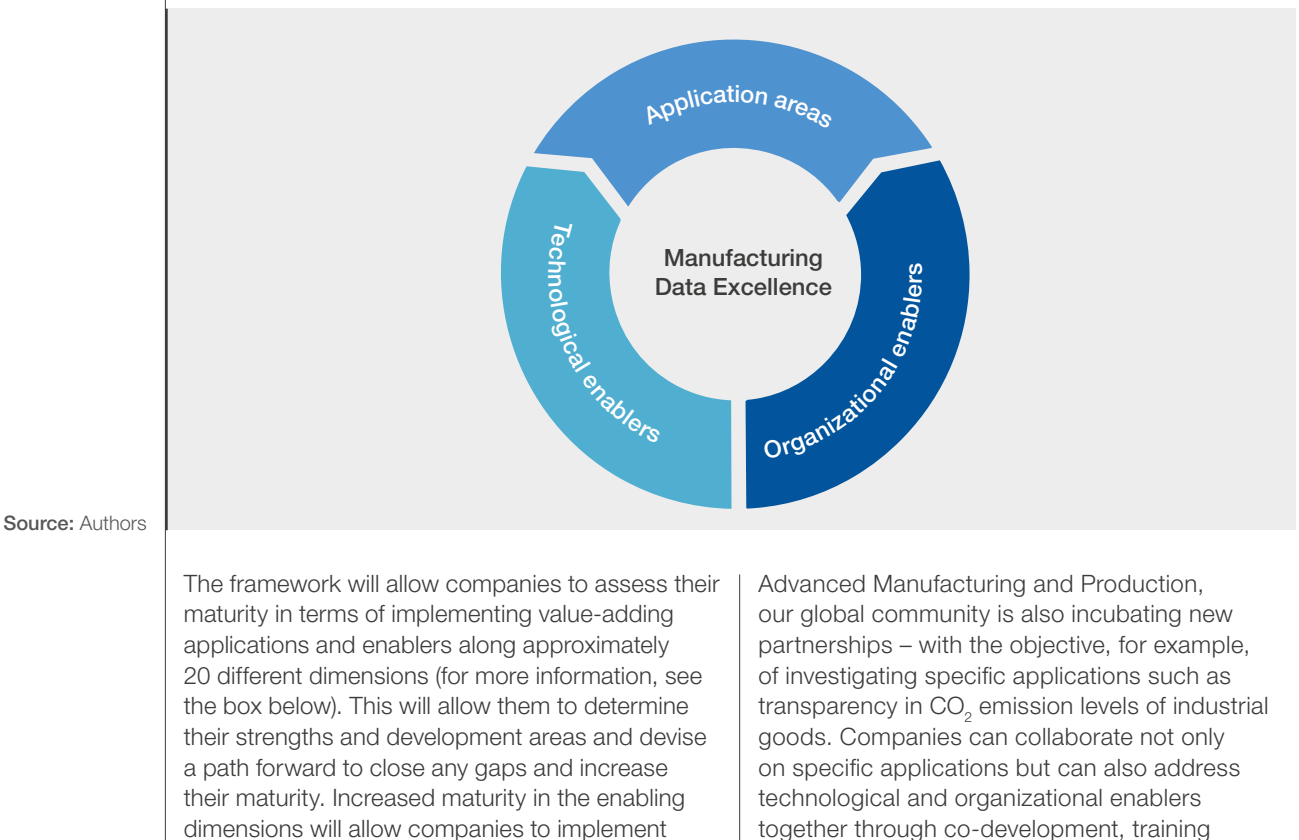
FIGURE 4 Manufacturing Data Excellence Framework

With its unique positioning in the World Economic Forum's Platform for Shaping the Future of