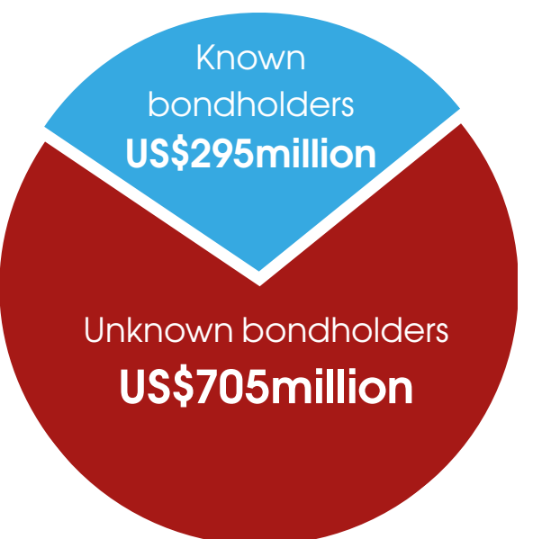
Figure 3: Known and unknown bondholders for Zambia's $1 billion Eurobond due to mature on 14 April 2024

and existing public health and social protection programmes, which could address gender inequalities,<sup>13</sup> at risk, with the IMF hinting that Kenya will require 'fiscal consolidation' (i.e. austerity and cuts to public spending) to balance its books.<sup>14</sup>