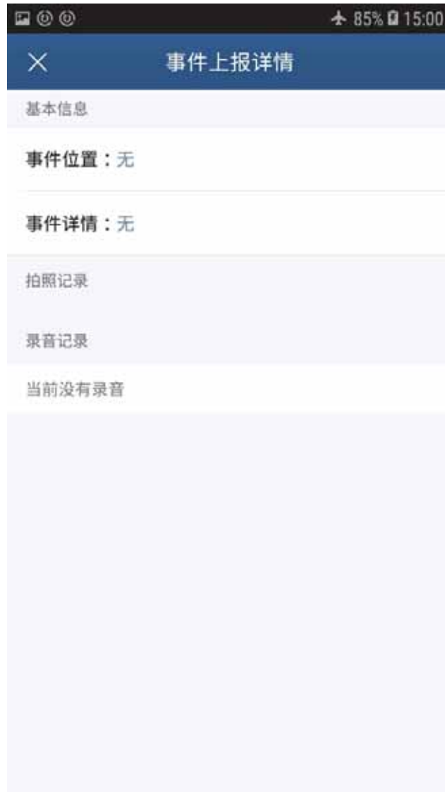
Fig.34: Screenshot showing details of an incident report.