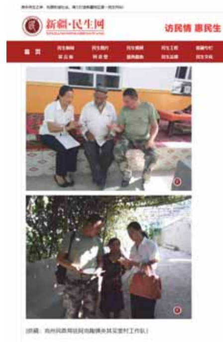
An article written by officials from the Xinjiang Bureau of Civil Affairs shows how they visited villagers and collected their information using the IJOP app in Akto County, Kizilsu Kirghiz Autonomous Prefecture, Xinjiang.

We know that there are at least two other apps that Xinjiang government officials use to gather personal data from residents: an app for Xinjiang officials when they conduct intrusive home