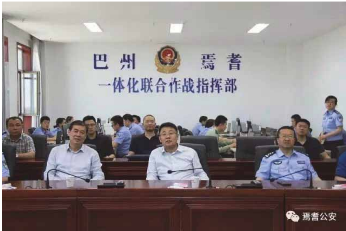
A police WeChat post showing an IJOP command center in Karasahr (or Yanqi in Chinese) Town, Yanqi Hui Autonomous County, Bayingolin Mongol Autonomous Prefecture, Xinjiang.

officer is also prompted to note the person’s behavior, and whether the person seems suspicious and needs to be investigated further.