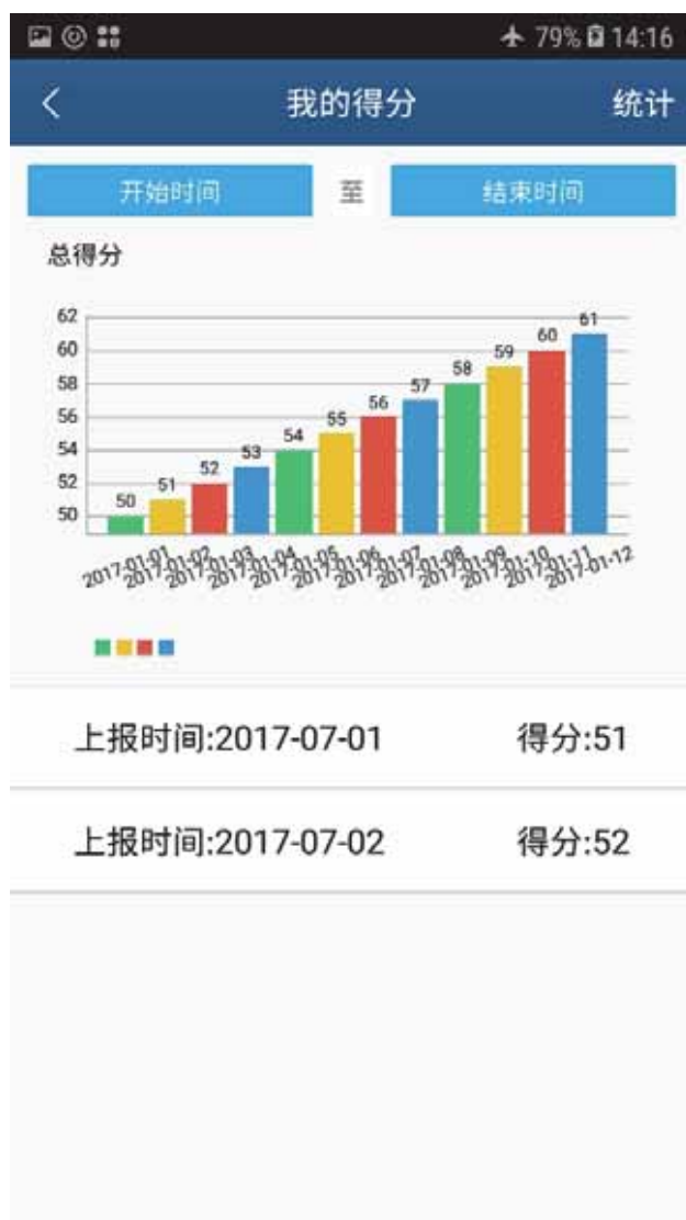
Fig.29: A screenshot entitled “my score” evaluates officials’ progress accomplishing IJOP-related tasks.