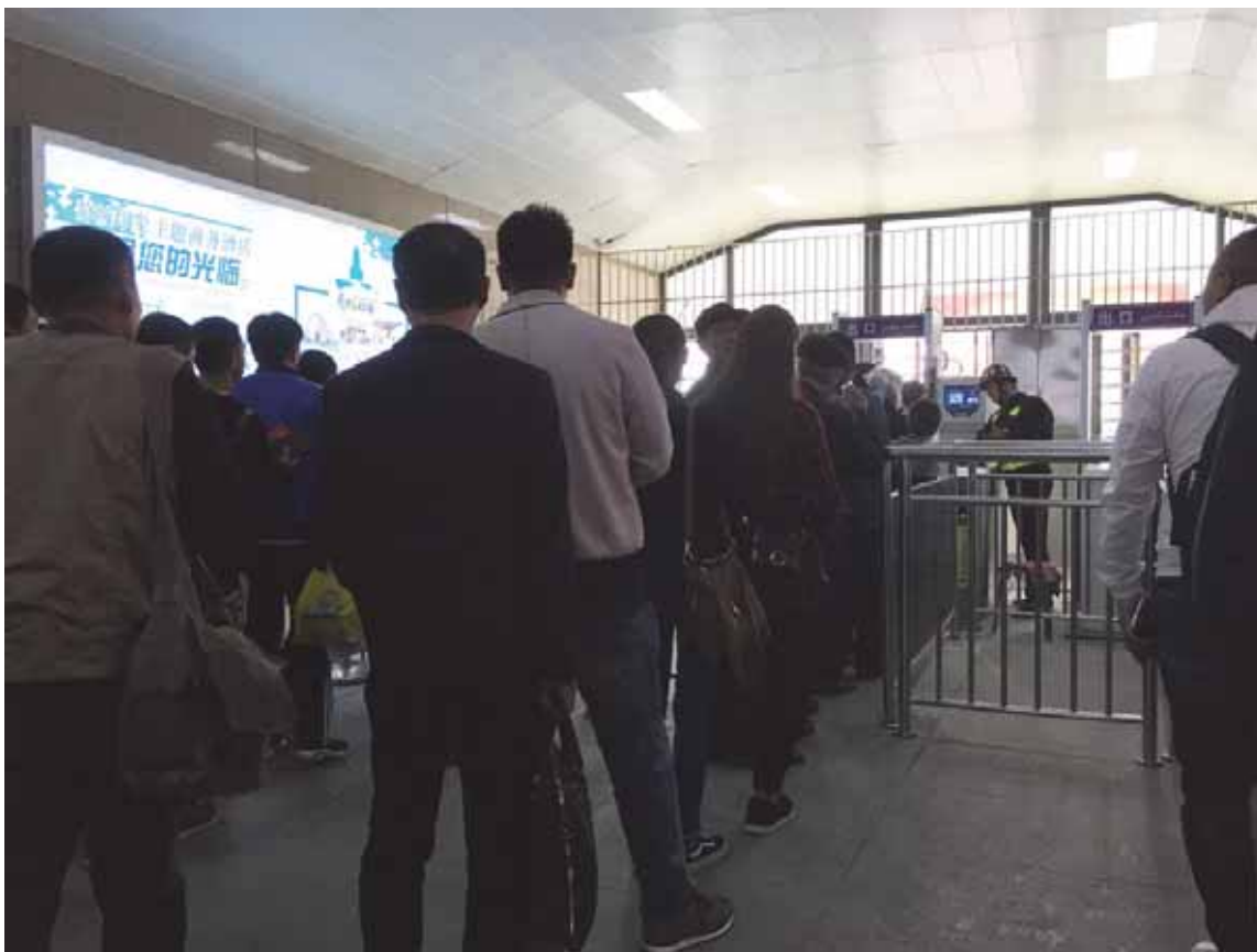
A checkpoint in Turpan, Xinjiang. Some of Xinjiang's checkpoints are equipped with special machines that, in addition to recognizing people through their ID cards or facial recognition, are also vacuuming up people's identifying information from their electronic devices.

checkpoints, these “data doors” are detecting and collecting MAC addresses and IMEI numbers of the person's phones, and logging such data for identification and tracking purposes.