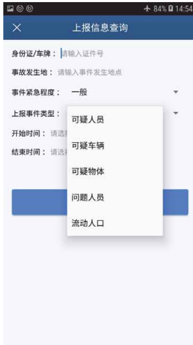
Fig.32: Screenshot showing how officials can search for incident reports filed concerning suspicious vehicles, objects, people, or about internal migrants.