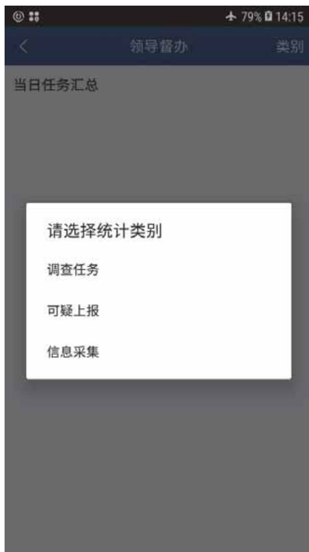
Fig.28: A screenshot entitled “leader supervision” showing how supervisors can keep tabs on lower-level officials as they accomplish IJOP-related tasks.