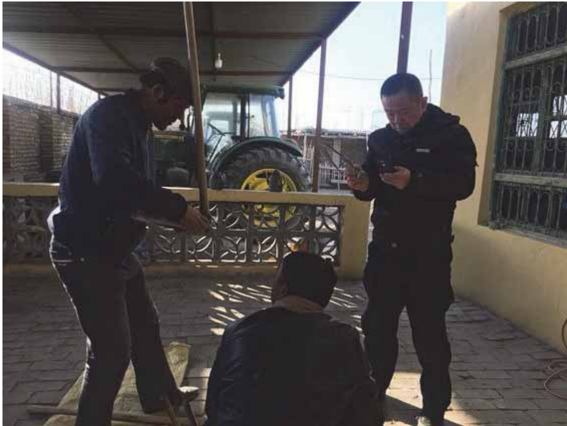
A Xinjiang Police College webpage shows police officers collecting information from villagers in Kargilik (or Yecheng) County in Kashgar Prefecture, Xinjiang.

On this page, the IJOP app requests different types of data depending on the type of situation in which information is being collected. For example, when officials are collecting information from people “on the street,” “in political education camps,” or “during registration for those who have gone abroad,” the app further prompts them to choose from a drop-down menu whether the person in question belongs to one of 36 types of problematic “person types.”