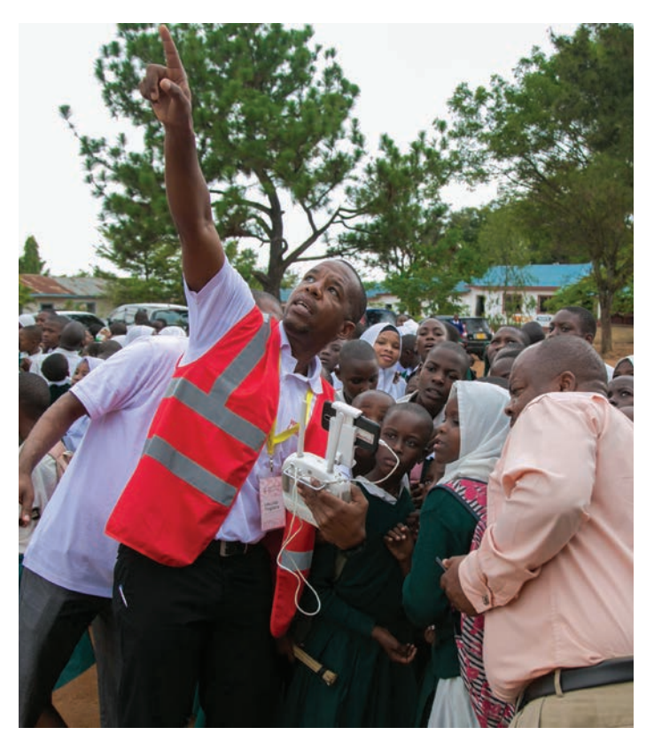
Institutionalized skills and training : Developing the skills, knowledge and abilities for drone operation, data collection, processing and value delivery is a fundamental need in promoting an ecosystem that is yet undeveloped. These objectives can be addressed by international and domestic

In Rwanda, before any technology service providers had entered the country, the government set up a Drone Advisory Council that included members of the Ministry of Health, Ministry of Transportation, Ministry of Infrastructure, Office of the President, Security Organs and Ministry of Agriculture to understand the landscape, opportunity, challenges and knowledge gaps facing the adoption and integration of drone technologies. The Ministry of Health, recognizing the need for fortifying and improving the supply chain of blood, worked with the President's Office and the CAA to develop an initial trial opportunity and attracted the drone operator Zipline.