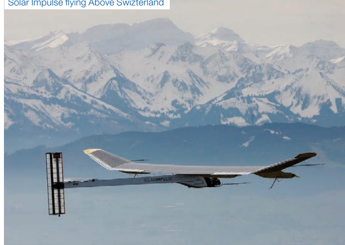
Solar Impulse flying Above Swizterland

All police need a detailed knowledge of the project, including emergency concepts, routes, altitudes, times, distances and emergency procedures