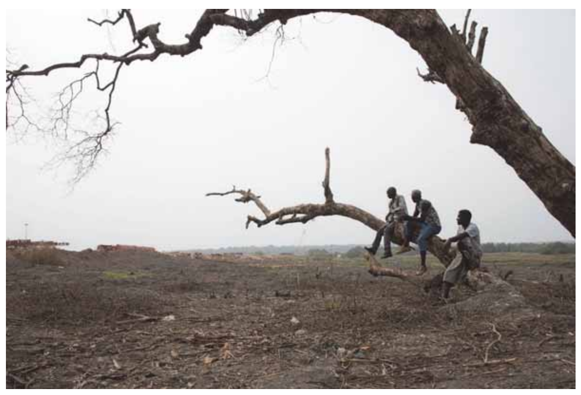
Farmers from Dapilon village, in the Boké region, look out over land, on the banks of the River Nunez, cleared for the construction of a mining port belonging to the La Société Minière de Boké consortium.

to improve your house, but now that your farmland has gone you still have to put food on the table."