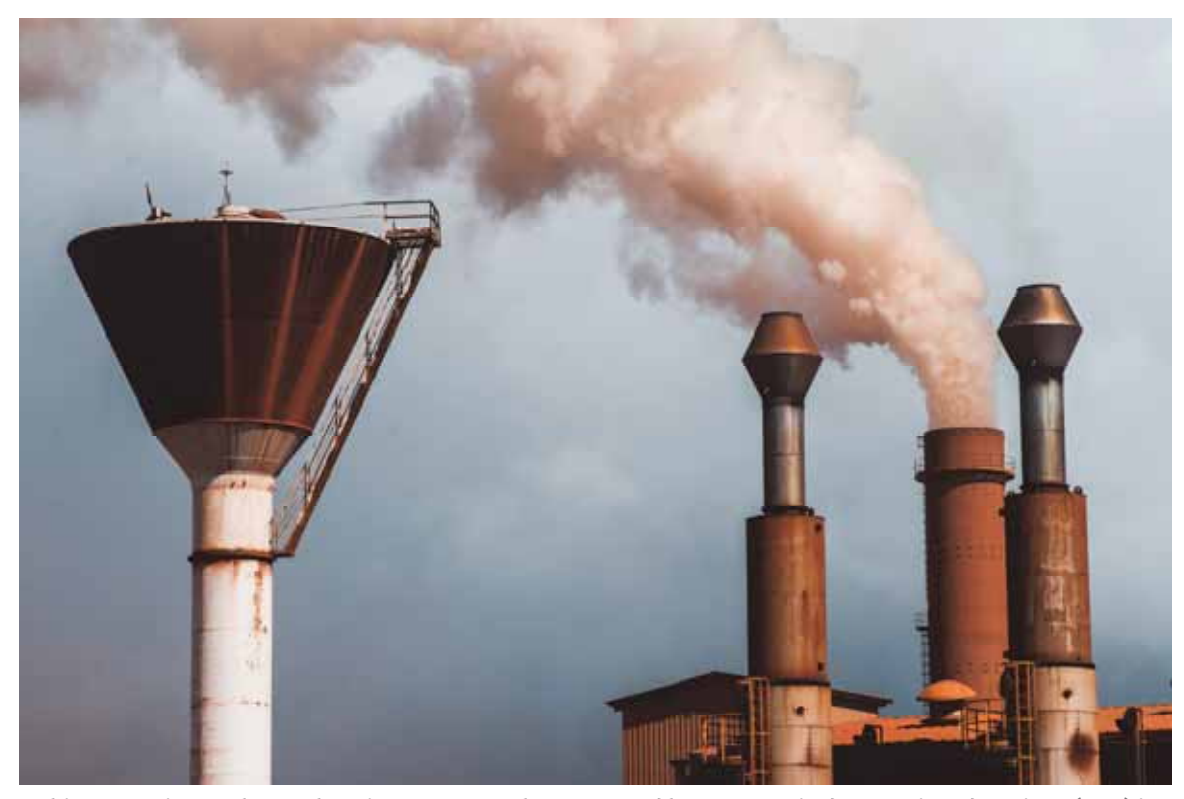
A chimney emits smoke at a bauxite treatment plant operated by Compagnie des Bauxites de Guinee (CBG) in Kamsar, Guinea, on September 7, 2015. Local leaders have long expressed concerns about the impacts of the emissions on local air quality.

emissions produced by CBG's operations, including in residential areas, both at current production levels and as production increases during the expansion project.<sup>375</sup>