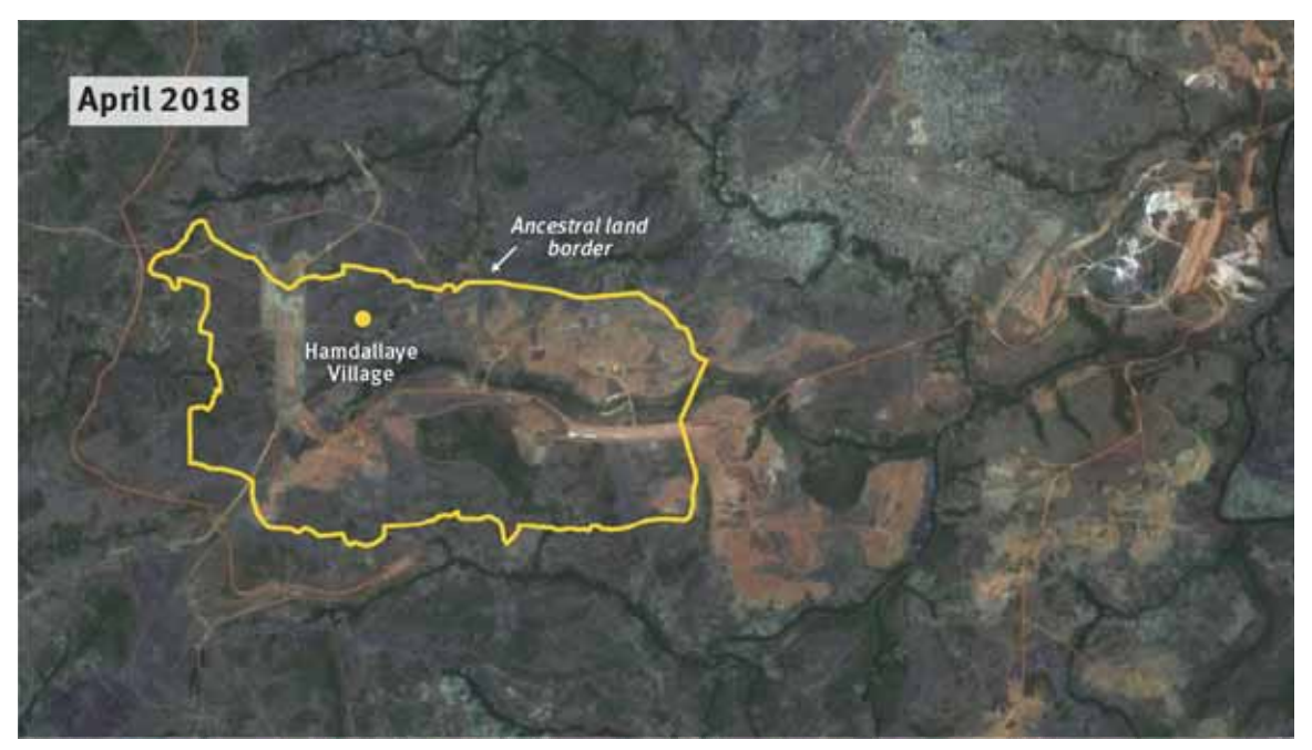
Two satellite images, one from May 2002 and another from April 2018, show how the mining operations of La Compagnie des Bauxites de Guinée (CBG) have encroached onto the ancestral lands of Hamdallaye village. The ancestral lands are marked with a yellow border.