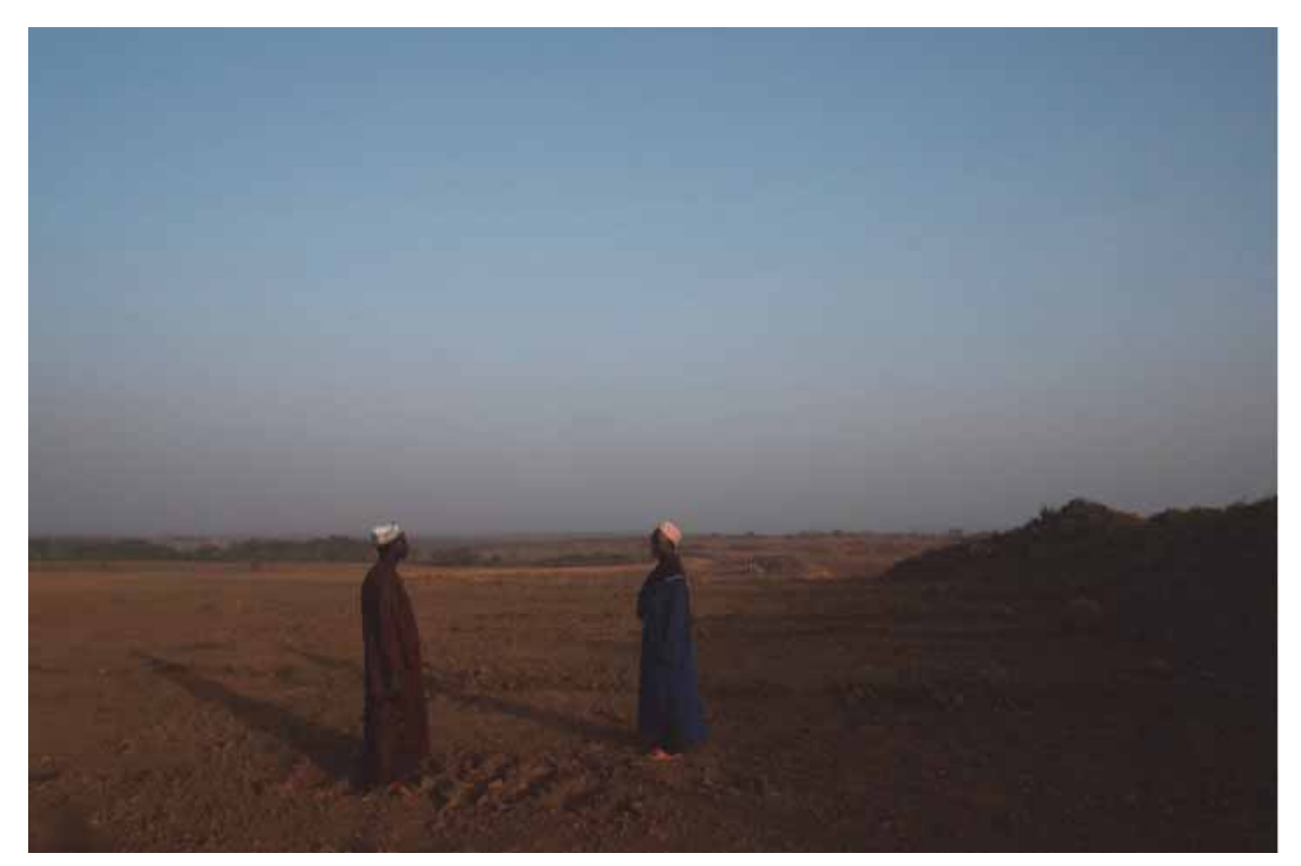
Farmers from Hamdallaye village, in the Boké region, look out over the village's ancestral lands, which have been cleared by La Compagnie des Bauxites de Guinée for an expansion of mining operations. January 2018.