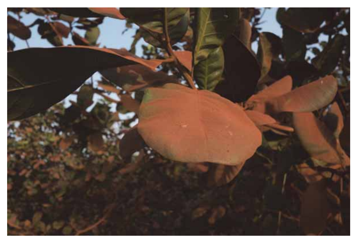
A tree covered in dust next to a mining road operated by the La Société Minière de Boké consortium. Communities state that the dust kicked up by the hundreds of trucks transporting bauxite on mining roads has reduced the productivity of surrounding trees and crops.

Satellite imagery reviewed by Human Rights Watch also revealed large, uncovered piles of bauxite ore inside the SMB consortium's two ports, at Dapilon and Katougouma, and showed evidence that wind is blowing dust as far as two kilometers from the ports, reaching five villages close to Dapilon port and four close to Katougouma. "You can run your finger down the wall of any of the houses here, and there'll be dust," said a community leader from Katougouma. "You clean it off, and it just comes straight back." Another community leader from Katougouma told a government inspection mission in February 2018 that: "The dust here has created coughs among the inhabitants of Katougouma, especially for older people and newborns....help us to reduce the dust because the company itself doesn't want to do anything about it." The BGEEE in April 2017 stated that at Katougouma port: "The unloading of trucks, the loading of barges, the