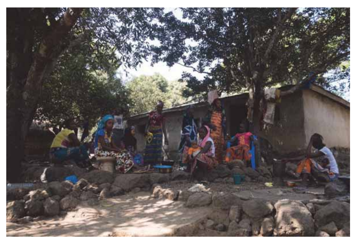
Women prepare food in Hamdallaye village in the Boké region. Compensation payments for land lost to mining are often paid to male heads of household or linages, even where the land is utilized by entire families or households.

A widow said compensation for her household's land was awarded to her husband's family, denying her the revenue she used to support her children. "I used to grow rice and maize in the land where the port is now," she explained. Because the compensation was paid after my husband died, it was his family who participated in the census that SMB conducted, and they are the ones who received the money from the company. I know who's got the money, but I can't go and claim it. Female elders said this had happened to several other widows in the same village.