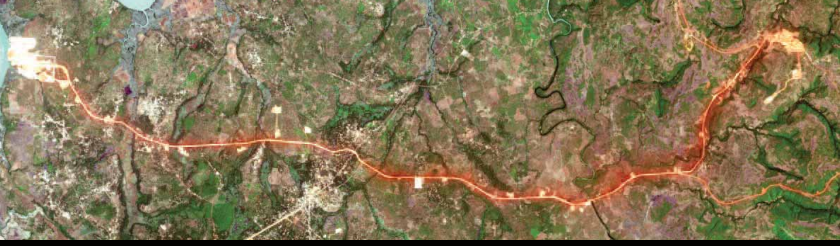
(above) Satellite imagery, from February 24, 2017, showing a mining road operated by the Société Minière de Boké (SMB) consortium. The hundreds of lorries transporting bauxite on the unpaved road cover trees and homes in dust.