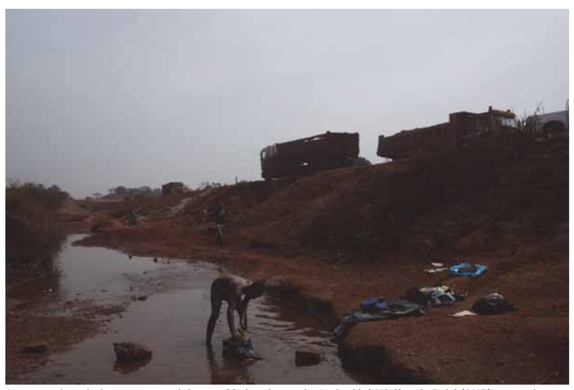
A man washes clothes next to a mining road belonging to the La Société Minière de Boké (SMB) consortium. Local communities state that the construction of SMB's mining roads blocked rivers and streams, diverting their course and reducing water levels in local wells.

Mining companies underscore that there are multiple reasons for inadequate access to water in the Boké region, including population migration, climate change-related factors and the aridity of the area, particularly in the dry season. They say they take steps to mitigate the impact of mining on local water sources and highlight their work to build boreholes and wells in mining-affected communities. The absence of public government or company data regarding the impact of mining on water levels and quality, however, makes it difficult to assess the adequacy of companies' responses.