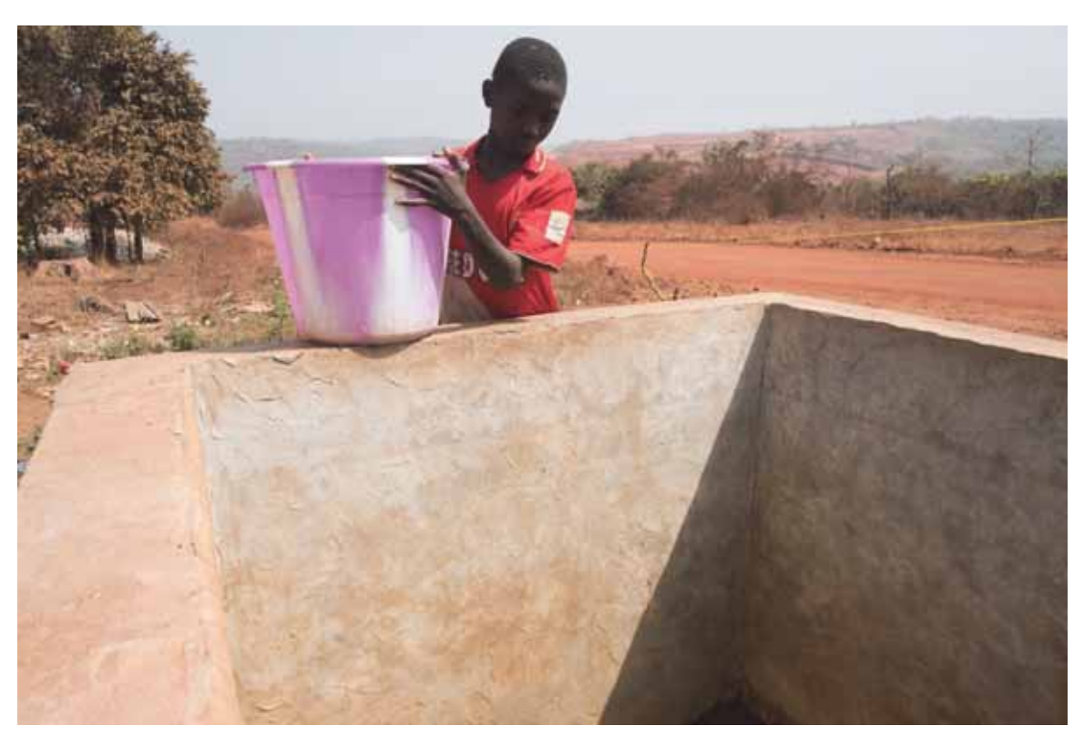
A boy fetches water from a tank used to store water delivered to Lansanayah village, in the Boké region, by tankers of Société Minière de Boké's (SMB) consortium. Villagers say that SMB's arrival damaged local natural water sources, forcing them to rely on the consortium to provide alternatives.

availability for several years, although it began a limited monitoring program in 2018. The Guinean government in 2017 commissioned a yet-to-be-published study into the cumulative impacts of bauxite mining in the Boké region, which should provide useful information on the impacts of mining on water levels, availability and quality.<sup>208</sup>