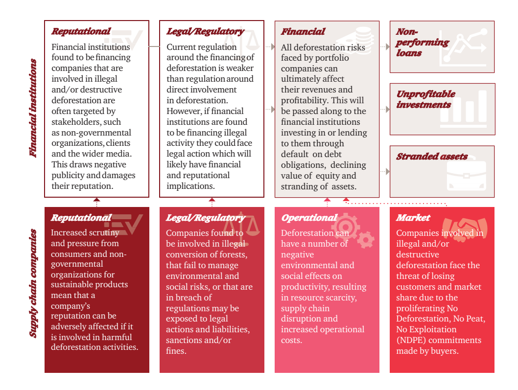
Figure 1: Potential material effects of deforestation risks on financial institutions