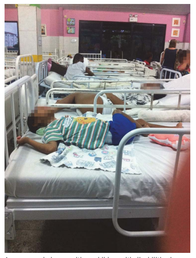
An overcrowded room with 40 children with disabilities in an institution in Bahia. Many institution managers reported that they had insufficient staff to care for the large number of residents.

with high support needs lay down almost continuously, being brought out of bed and placed in a wheelchair only for short periods.<sup>27</sup> In one of the institutions Human Rights Watch visited in Rio de Janeiro, dozens of people with so-called "severe" disabilities were separated on the upper floor of the building. Up to eight people lived in small rooms, some of them restrained to metal bars of the bed by a cloth around their waists. A nurse in this institution said that people there "never leave the room."28