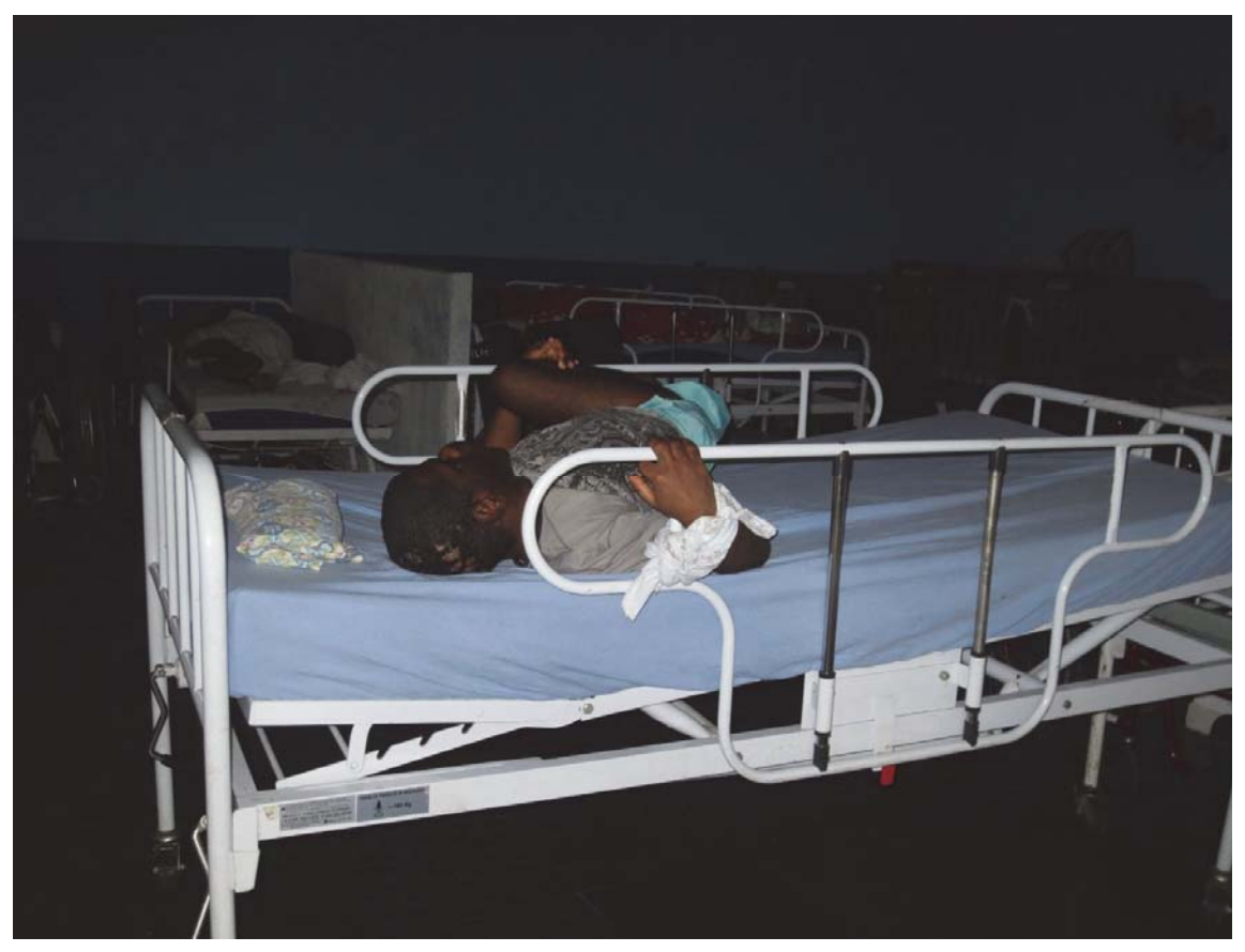
A young man restrained to his bed in an institution for 32 people with disabilities in Rio de Janeiro. Staff in some institutions for people with disabilities in Brazil physically restrained adults to bed rails with pieces of cloth bound around their waists or wrists.

At the time of Human Rights Watch's visit to a special institution for children with disabilities in Rio de Janeiro in the middle of the day, all 12 children living there were lying in their cribs without anything to engage them. <sup>43</sup> In five institutions in Rio de Janeiro and São Paulo, staff placed children in front of the television to watch whatever program was on. <sup>44</sup> In one institution visited, dozens of children under the age of 10 were placed in front of a television for the entire time of Human Rights Watch's four- hour visit. <sup>45</sup> Some activities were organized within the institutions for children and adults, including by bringing in outside groups to provide entertainment. For example, a group of volunteers dressed as clowns makes periodic visits to the institutions to entertain residents.