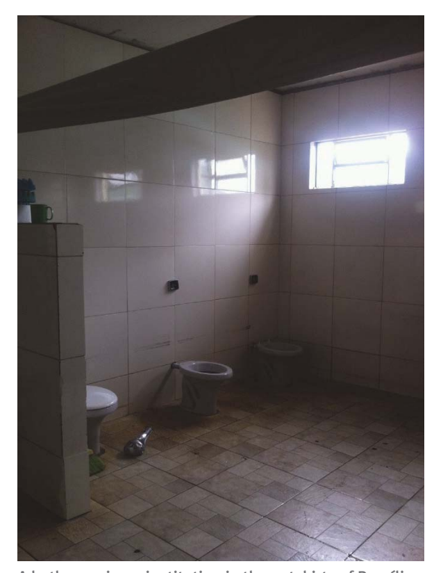
A bathroom in an institution in the outskirts of Brasília (Distrito Federal). Many institutions for persons with disabilities in Brazil do not ensure residents' privacy.

Residents overwhelmingly had no privacy and had few or no personal items. In some cases, they even had to share clothes—and in one facility, even toothbrushes—with others. In some adult institutions staff did not assist residents to get dressed, leaving them unclothed from the waist down, wearing only diapers. Several institutions advertised tours for the public and solicited donations online relying on images of persons with disabilities as needy, vulnerable, and in need of care, rather than as autonomous individuals. In many of the institutions visited by Human Rights Watch, the problems described below created an inhumane and degrading living environment for residents.