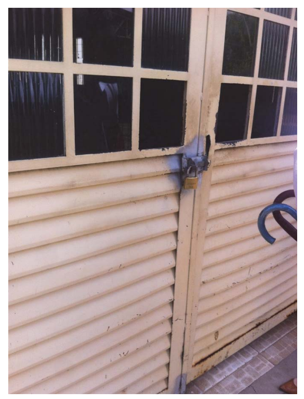
A locked door at an institution for people with disabilities in the outskirts of Brasília, (Federal District). Many institutions for adults with disabilities in Brazil have the look and feel of detention centers, with heavy doors with locks and barred windows in order to keep people inside.

Although children with disabilities are placed in institutions, including general institutions for children, for long periods of time, all three general children's institutions visited by Human Rights Watch lacked an accessible physical environment for people with disabilities. In one institution in São Paulo, for example, stairs at the entrance made it impossible for a child with physical disability to enter or exit independently.73 One institution in Salvador had only one bathroom with enough space for a wheelchair to fit, but it was in the girls' section.74 No bathroom in any general institution was fully accessible with toilets with raised toilet seats and support bars.