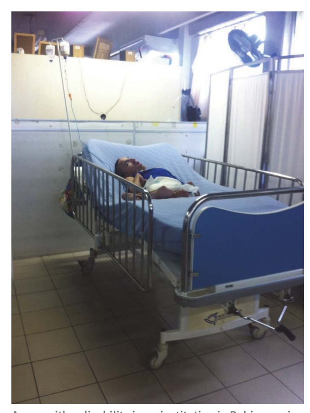
A man with a disability in an institution in Bahia wearing nothing but a diaper from the waist down. Staff in some institutions in Brazil do not fully dress adults with disabilities, in disregard for their dignity.

Human Rights Watch considers the failure to fully dress residents and the failure to ensure privacy when changing adult diapers to potentially