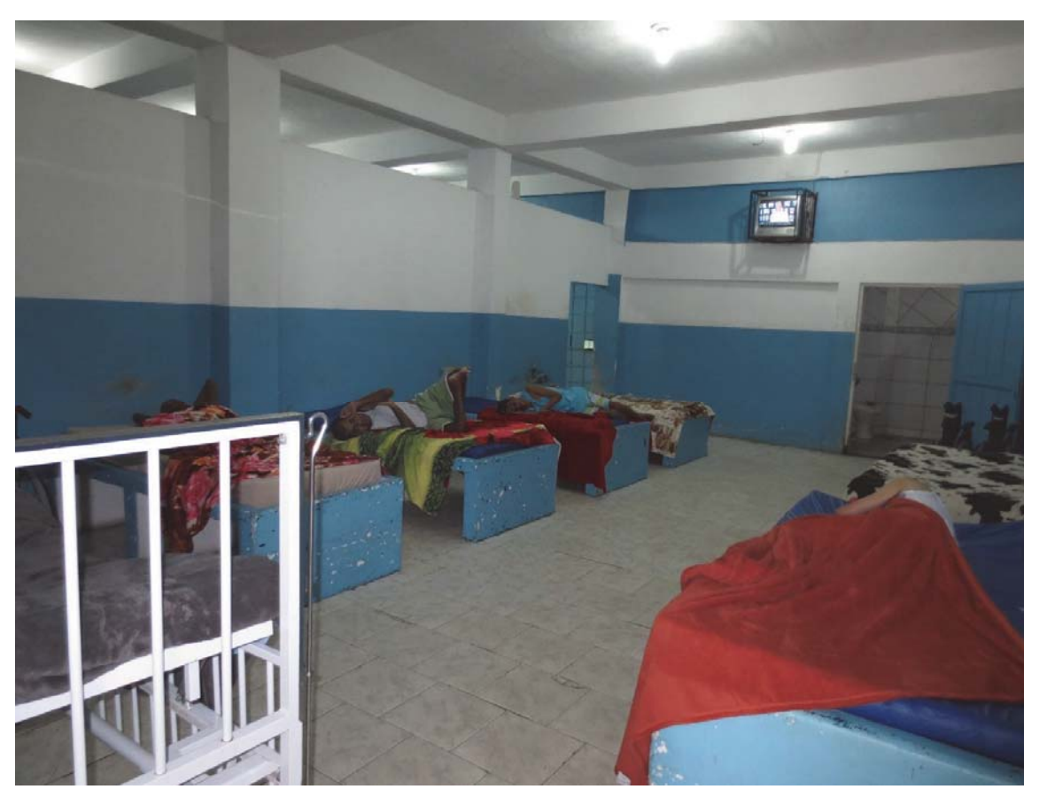
A room for 10 people in an institution for adults and children in Rio de Janeiro. Residents had little or no privacy and no personal belongings.

television for hours on end. Insufficient staff meant that children with disabilities often lacked human contact on a regular basis. Few children with disabilities in institutions visited by Human Rights Watch attend neighborhood schools. Those who did have access to education typically received limited instruction in segregated settings.