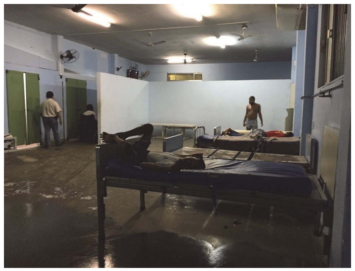
A psychiatric ward in an institution in Rio de Janeiro. Residents of most institutions in Brazil live in depersonalized conditions, have few if any personal belongings, and have little or no privacy.