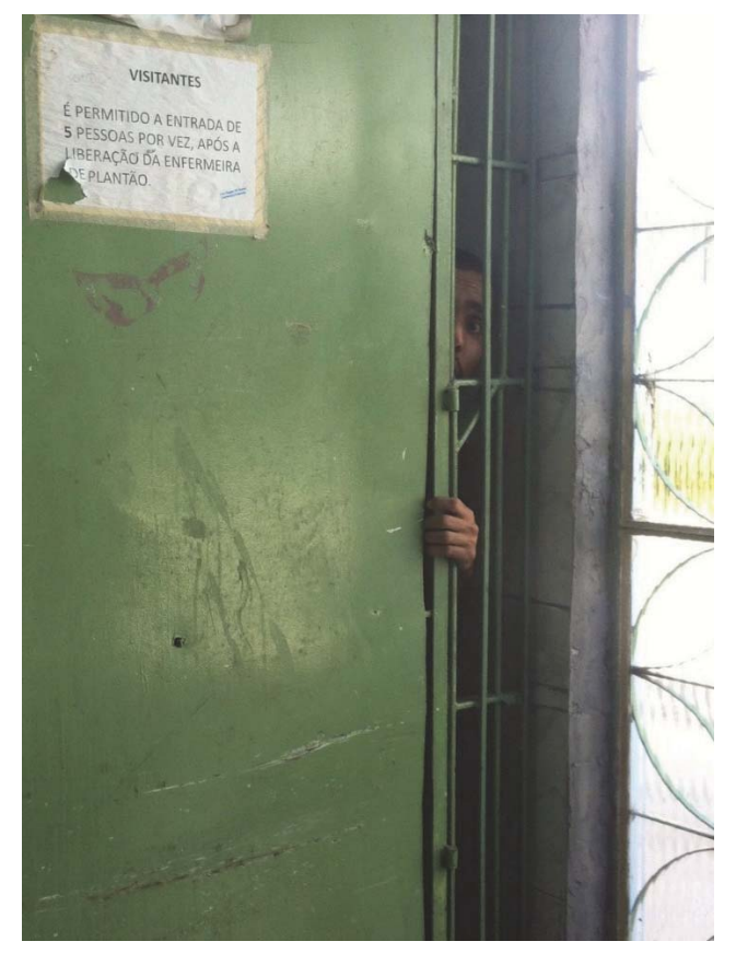
A man with disabilities looks out through the bars of a psychiatric ward in an institution in Rio de Janeiro. Persons locked in this section of the institution never left their rooms, according to staff.

we ... restrain them with sheets, or we use straitjackets for about 30 minutes while waiting for medication to take effect."19