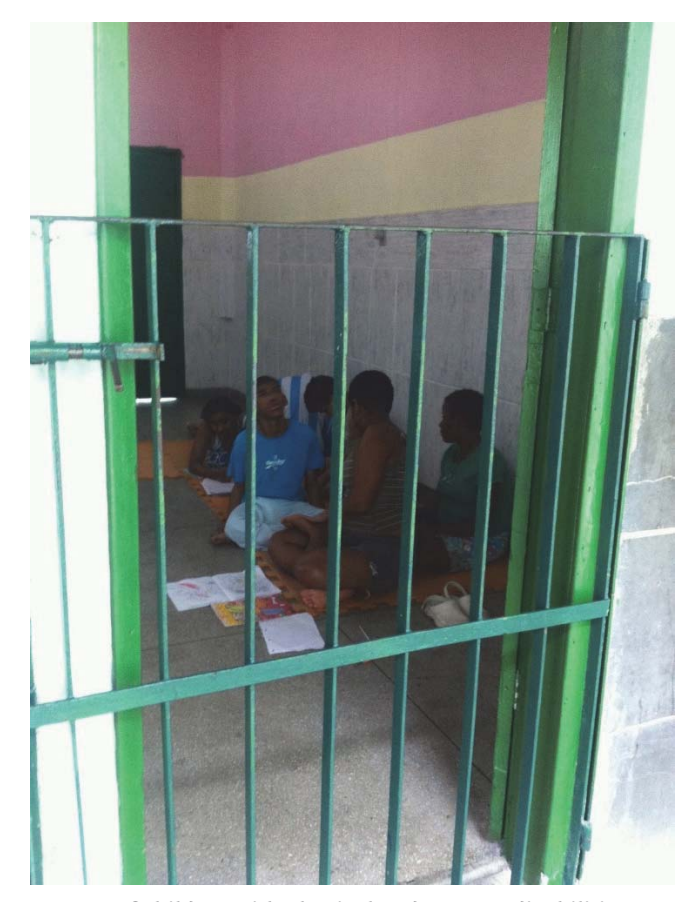
A group of children with physical and sensory disabilities drawing while sitting on the floor in a common room an institution in Rio de Janeiro. Drawing is one of the few activities that institution staff facilitate for children and adults with disabilities.

did not receive any education. In São Paulo, Human Rights Watch visited two institutions for children with disabilities with high support requirements; none of them received education. In an institution for 49 children and adults with intellectual and multiple disabilities in Ceilândia, one person was going to a regular school, the others had not received any schooling. In Bahia, Human Rights Watch visited an institution with 87 children and adults; none of whom received any education.61 In a second large institution in Bahia of 109 children with disabilities, 37 children, either with autism or high support requirements, or both, did not receive any education.62