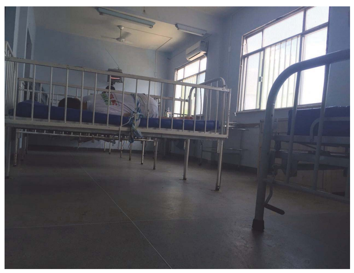
A psychiatric ward in an institution in Rio de Janeiro. Residents of most institutions in Brazil live in depersonalized conditions, have few if any personal belongings, and have little or no privacy.

Many officials and institution staff seemed essentially to justify a lack of enjoyment of rights and services by certain people, based on this vague and essentially arbitrary concept of "severe disabilities." The term as they applied it has no clear meaning, and instead seemed to represent a subjective and careless effort to create a category of people who can be stripped of their autonomy and rights. International human rights law protects all persons with disabilities, regardless of the so-called "level of impairment."