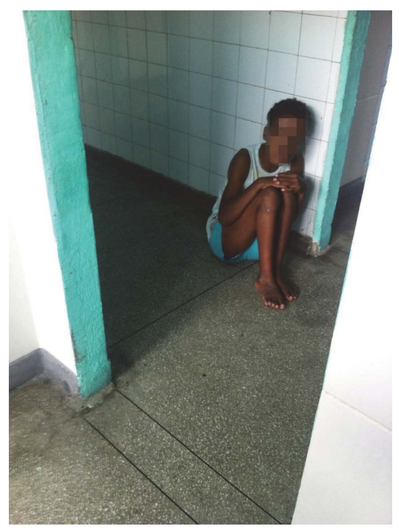
A young woman in a dormitory in an institution in Rio de Janeiro.