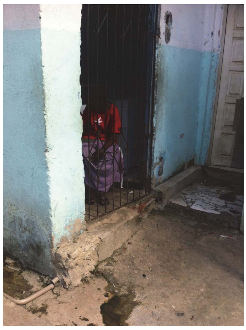
A young man with a physical disability sitting in his room in an institution in Bahia, located approximately 200m from the Atlantic Ocean. "My dream is to see the sea, but I have no wheelchair to go and see it," he said.