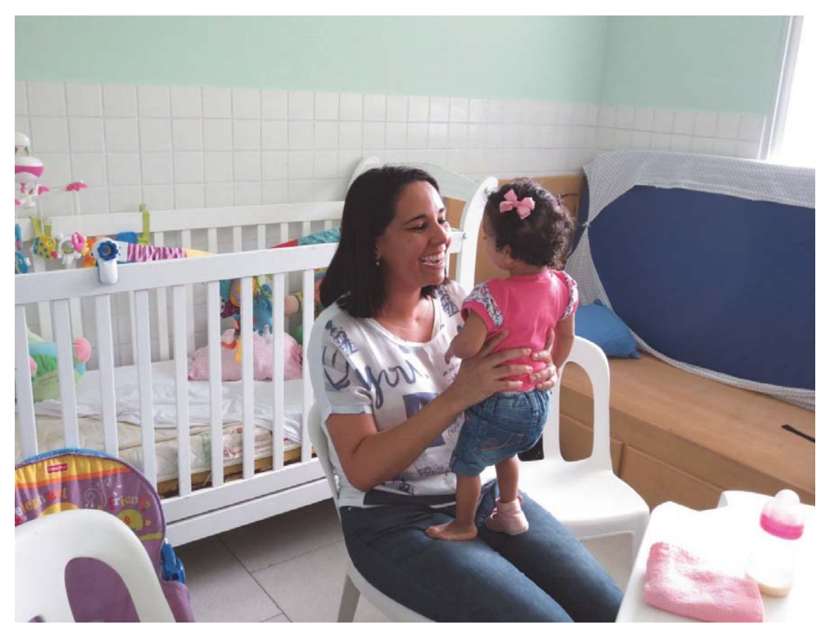
A mother with her 3-year-old adoptive daughter, who has developmental disabilities. The Brazil government should expand adoption and foster care to ensure children with disabilities can grow up in families, rather than institutions.