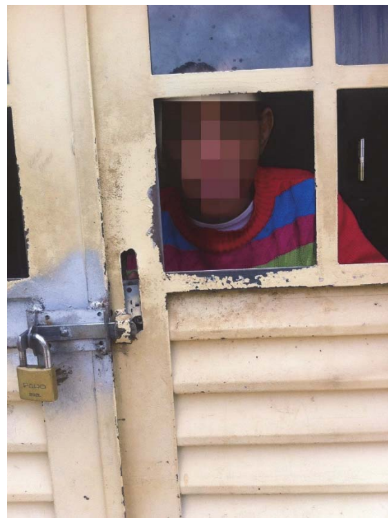
A man with an intellectual disability living in an institution for 51 people with disabilities in the outskirts of Brasília, Distrito Federal looking through a locked door.

In all adult institutions visited in Brazil, institution directors or staff members told