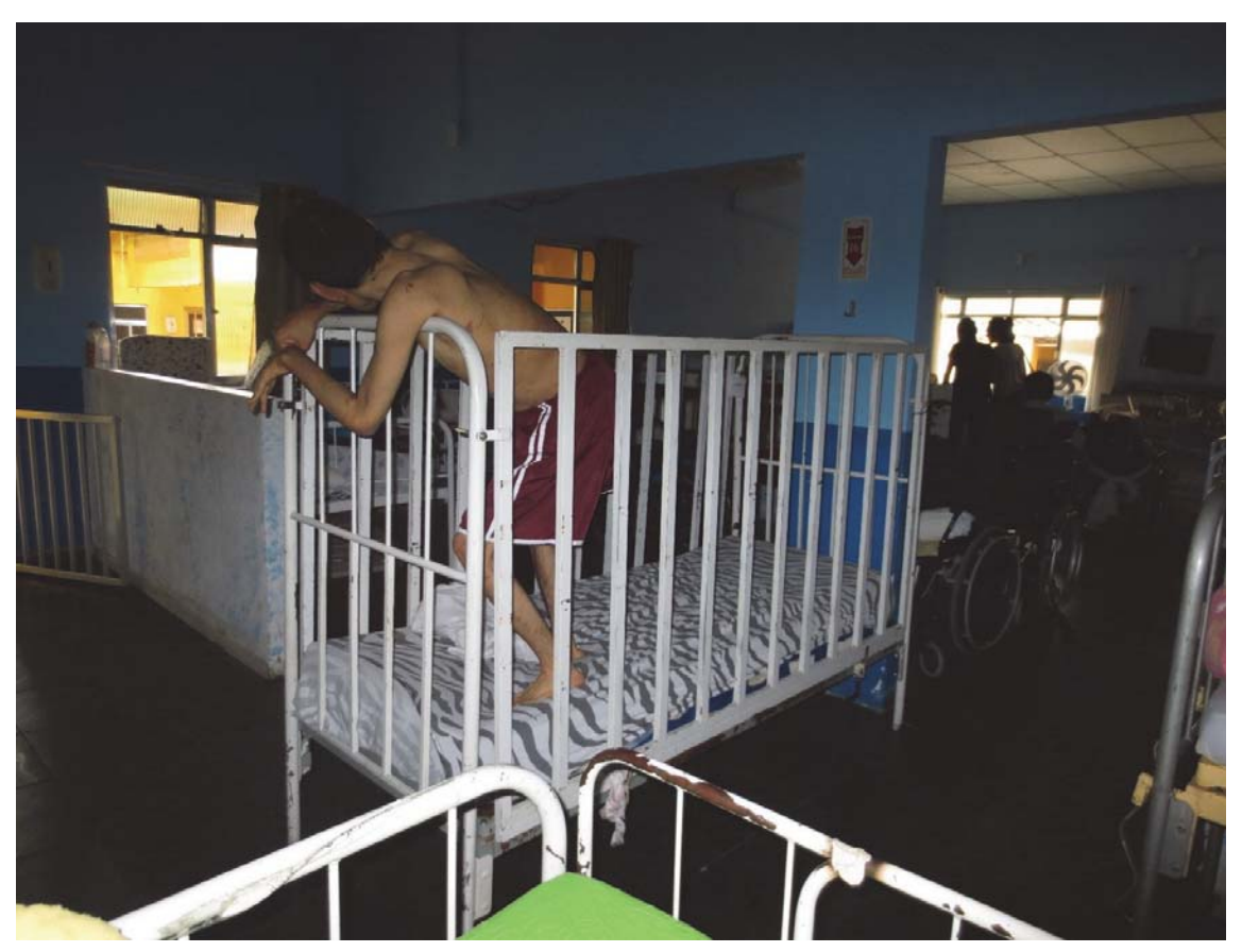
In many institutions, staff use beds with high bars to confine persons with disabilities.

one of the members of staff referred to adult residents as "children," saying, "Why do you talk to the children themselves? They aren't responsible for themselves, we are. You should talk to us, not them."<sup>120</sup> In an institution in São Paulo, after Human Rights Watch spoke to two residents who agreed to an interview, the administrative director intervened and ended the conversation. She said, "They are people with disabilities you cannot consider everything they say as true." She refused to acknowledge that the consent they had given to the interview as valid, saying only the institution director can give authorization.<sup>121</sup>