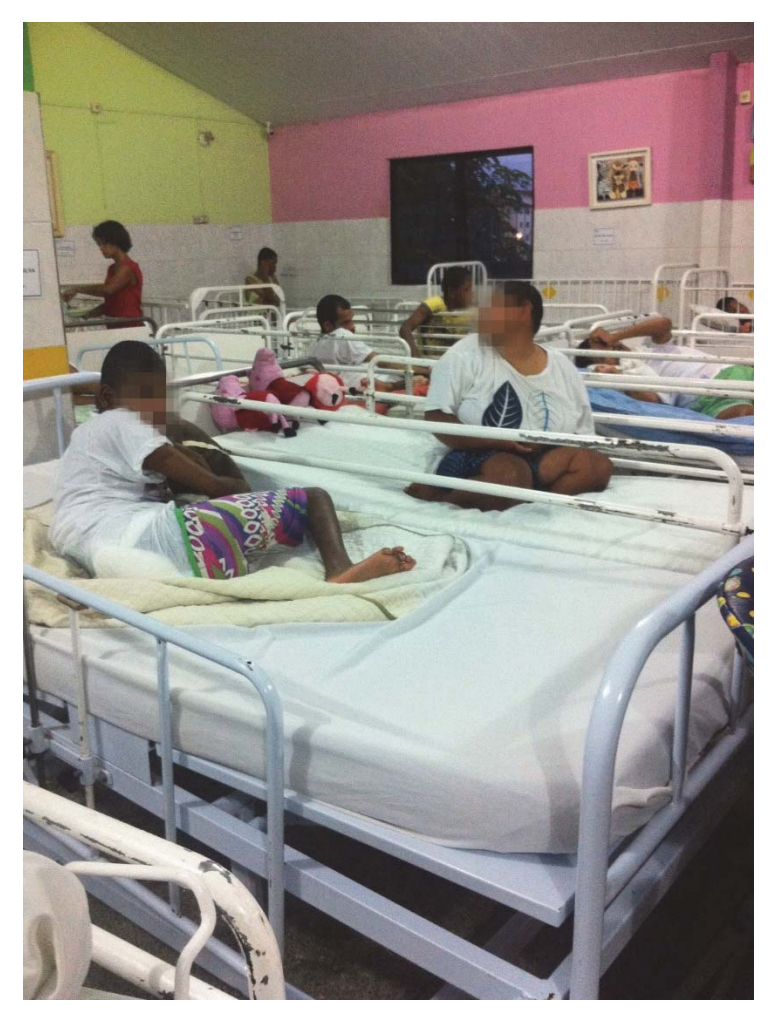
An overcrowded room with 40 children with disabilities in an institution in Bahia. Many institution managers reported that they had insufficient staff to care for the large number of residents.

Carolina (not her real name), a 50-year-old woman with a physical disability, describes her experience in the institution when she spoke to Human Rights Watch: