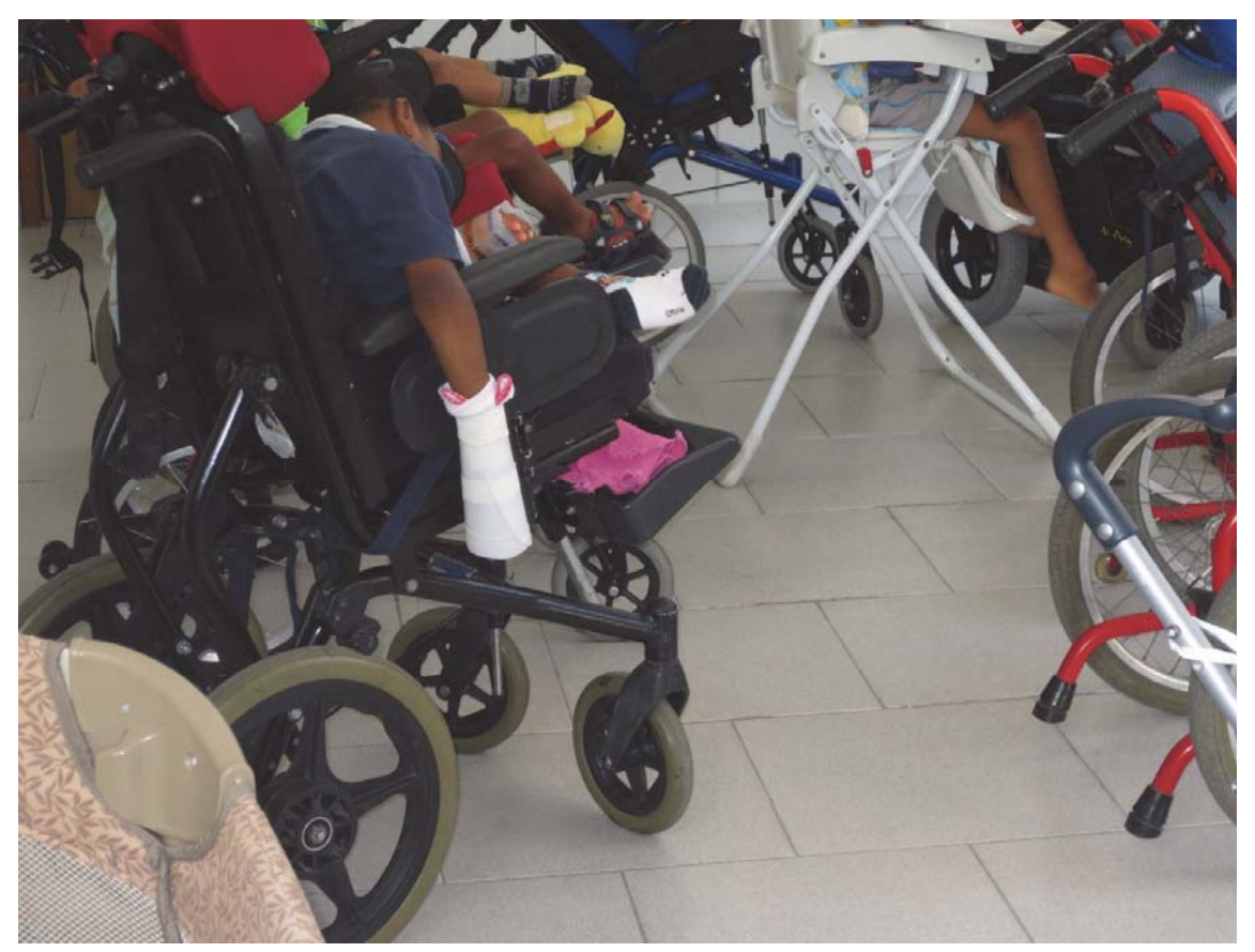
Staff in an institution in Rio de Janeiro bind the hands of children with disabilities to prevent them from biting their fingers or scratching themselves instead of implementing other methods, such as providing one-to-one personal support to prevent children from harming themselves. Due to the lack of sufficient staff, "We are unable to provide one to one personal attention all the time," one staff member said.