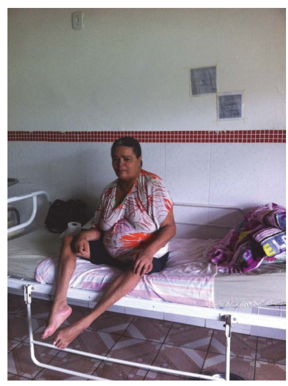
A 50-year-old woman with a physical disability in an institution in the outskirts of Brasília (Distrito Federal). She had lived in the institution for eight years and is not allowed to leave the institution without permission from her sons.

The CRPD Committee has stated that the "systematic realization of the right to independent living in the community requires structural changes," including phasing out institutionalization. The committee's guidance states that "no new institutions may be built by States parties, nor may old institutions be renovated beyond the most urgent measures necessary to safeguard residents' physical safety. Institutions should not be extended [and] new residents should not enter in place of those that leave." In conjunction with deinstitutionalization, states must provide a range of individualized support services which allow for personal choice and self-control. The aim of these individualized support services is the realization of full inclusion of persons with disabilities in society and preventing