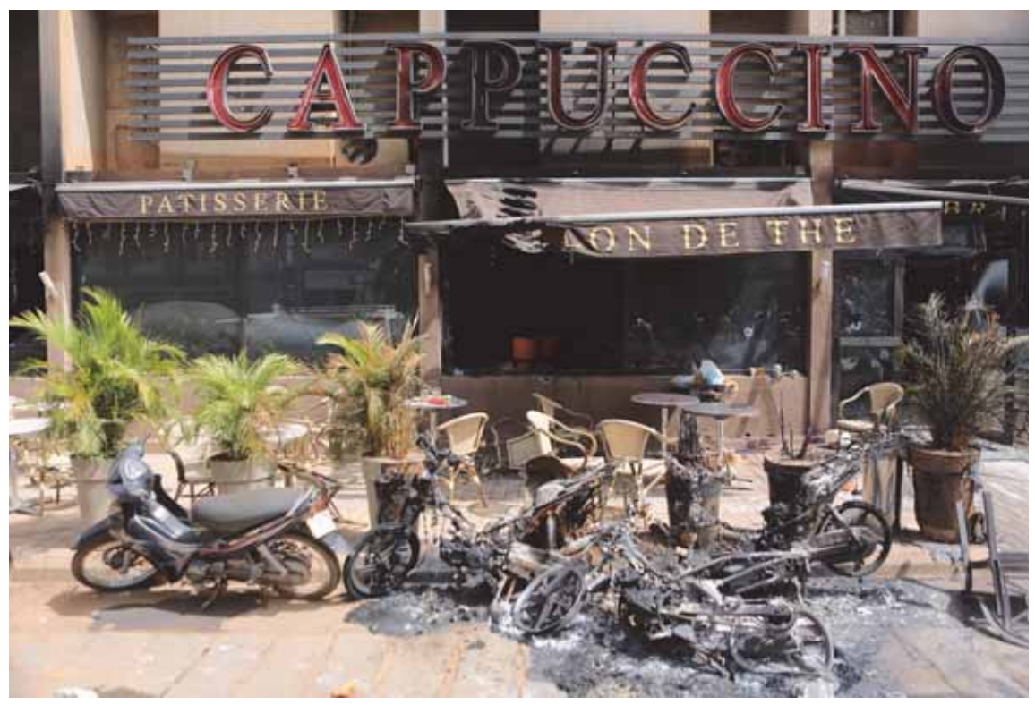
Armed Islamist groups Al-Qaeda and Al-Mourabitoun claimed the January 15, 2016 attack on the "Cappuccino" restaurant and cafe in Ouagadougou, which killed 30 people and left more than 70 wounded.

shielded myself behind a vehicle then used my belt to stop the bleeding,.... I passed out and only came to because my shoe had caught fire from petrol leaking from a burning car.<sup>41</sup>