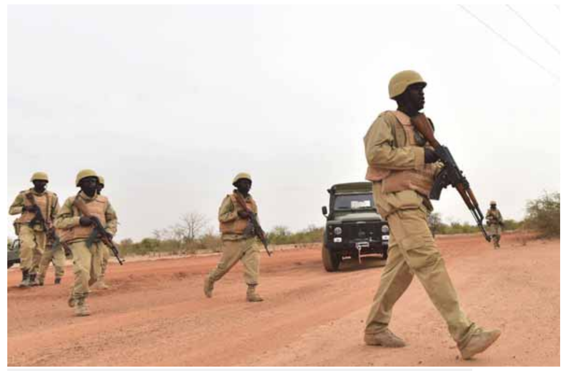
Soldiers from Burkina Faso take part in a training exercise in Burkina Faso on April 13, 2018.

under the direct command of the Army Chief of Staff. Security sources said GFAT's troops rotate from field bases every three months.<sup>48</sup>