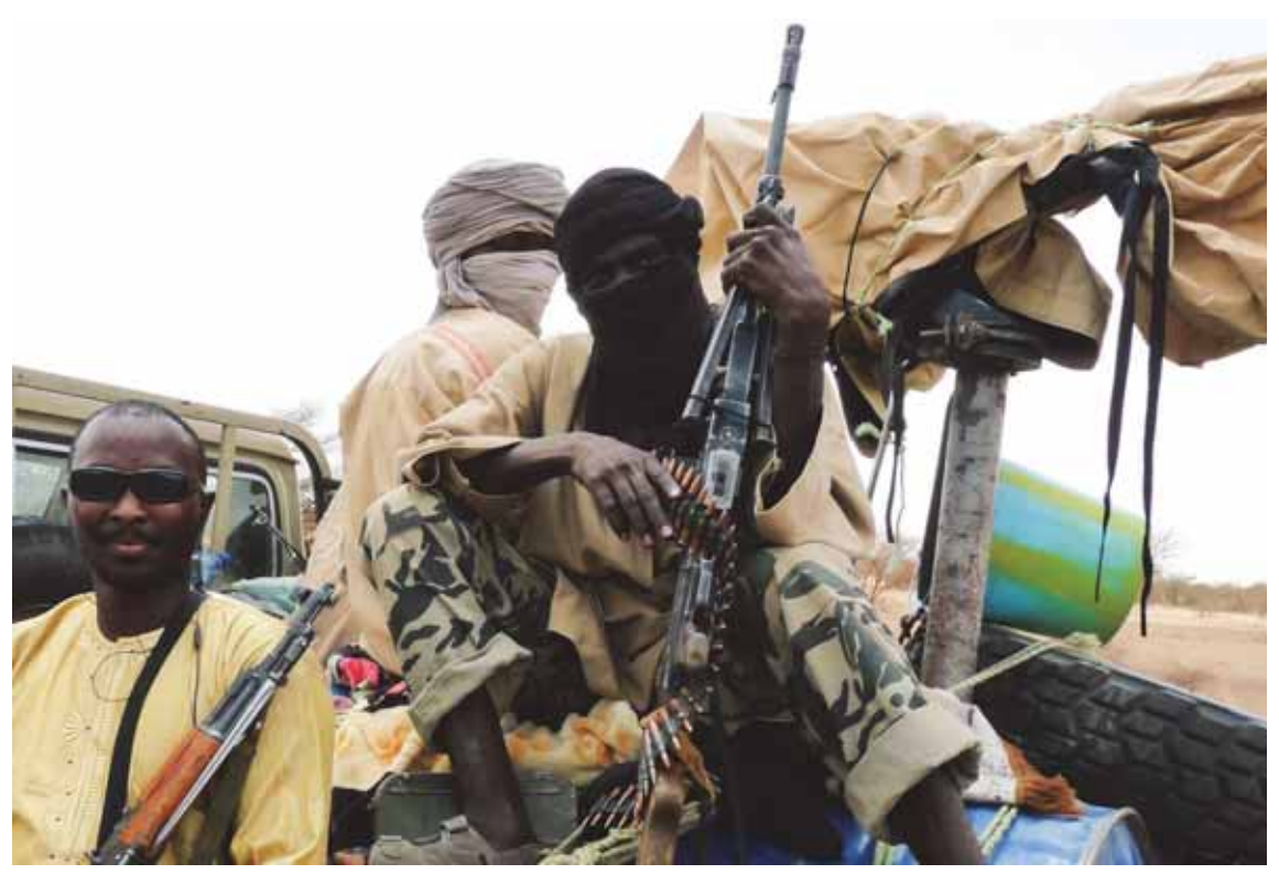
Combatants from Al-Qaeda-affiliated Islamist group Ansar Dine sit in a vehicle in Gao in northeastern Mali. The growing presence of armed Islamist groups in Burkina Faso is linked to insecurity in neighboring Mali, where northern regions fell to separatist Tuareg and Al-Qaeda-linked armed groups in 2012.