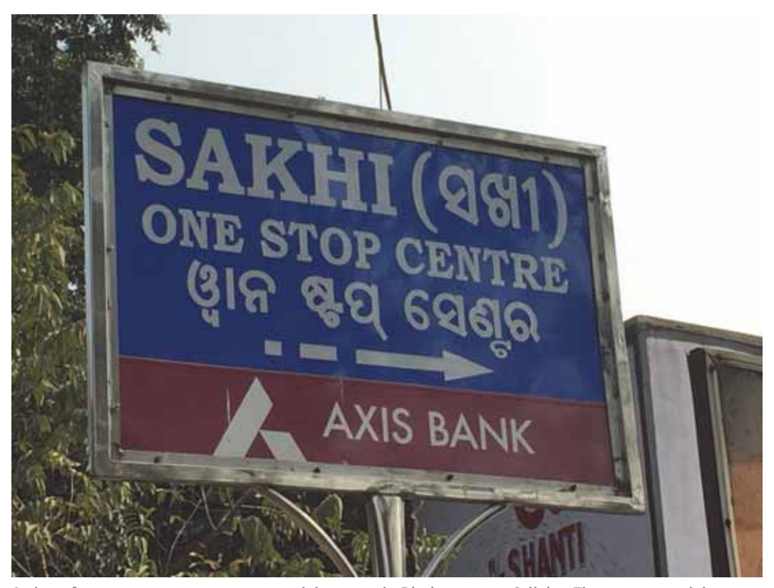
A sign of a government-run one-stop crisis center in Bhubaneswar, Odisha. The one-stop crisis centers are places where integrated services—police assistance, legal aid, medical and counseling services—are available to victims of violence. These centers can play a key role in ensuring care and justice.

The document issued in 2015 by the Ministry of Women and Child Development to guide implementation of the One-Stop Center Scheme lacks provisions for accessible infrastructure, communication assistance, or any other reasonable accommodations. The budget guidelines provided in Annexure II of the document, moreover, do not make provisions for audio-visual recording of statements and other accommodations for women and girls with disabilities mandated under the 2013 amendments and POCSO.<sup>137</sup>