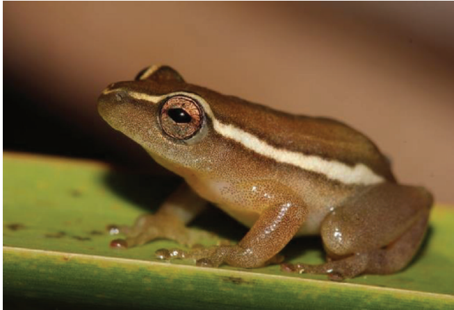
A male Pickersgill's Reed Frog, Hyperolius pickersgilli