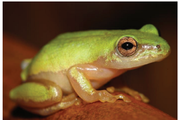
A female Pickersgill's Reed Frog, Hyperolius pickersgilli

Authors: Jeanne Tarrant 1 & Adrian Armstrong 2