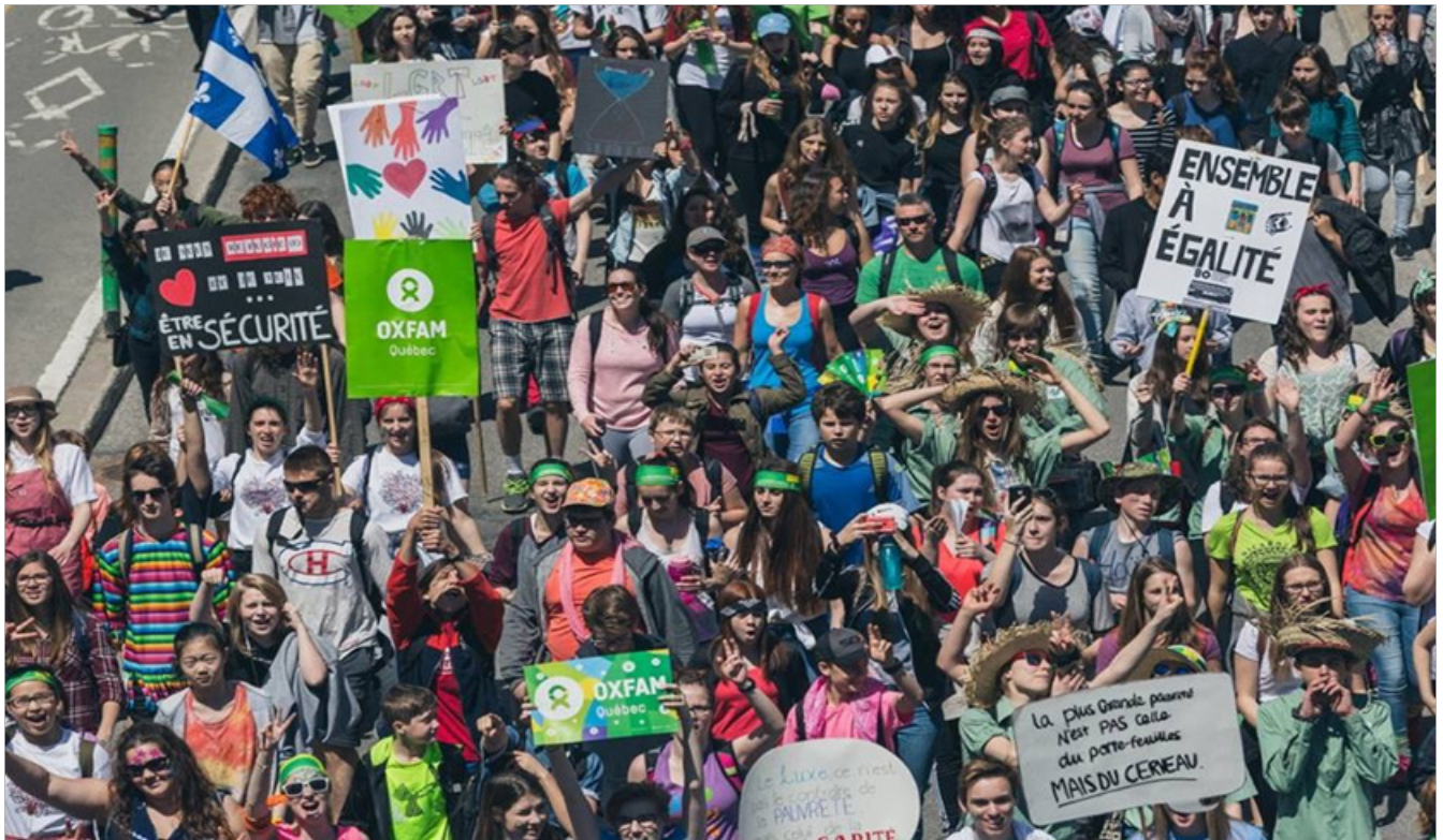
Marche Monde, Montreal 6 May 2016.