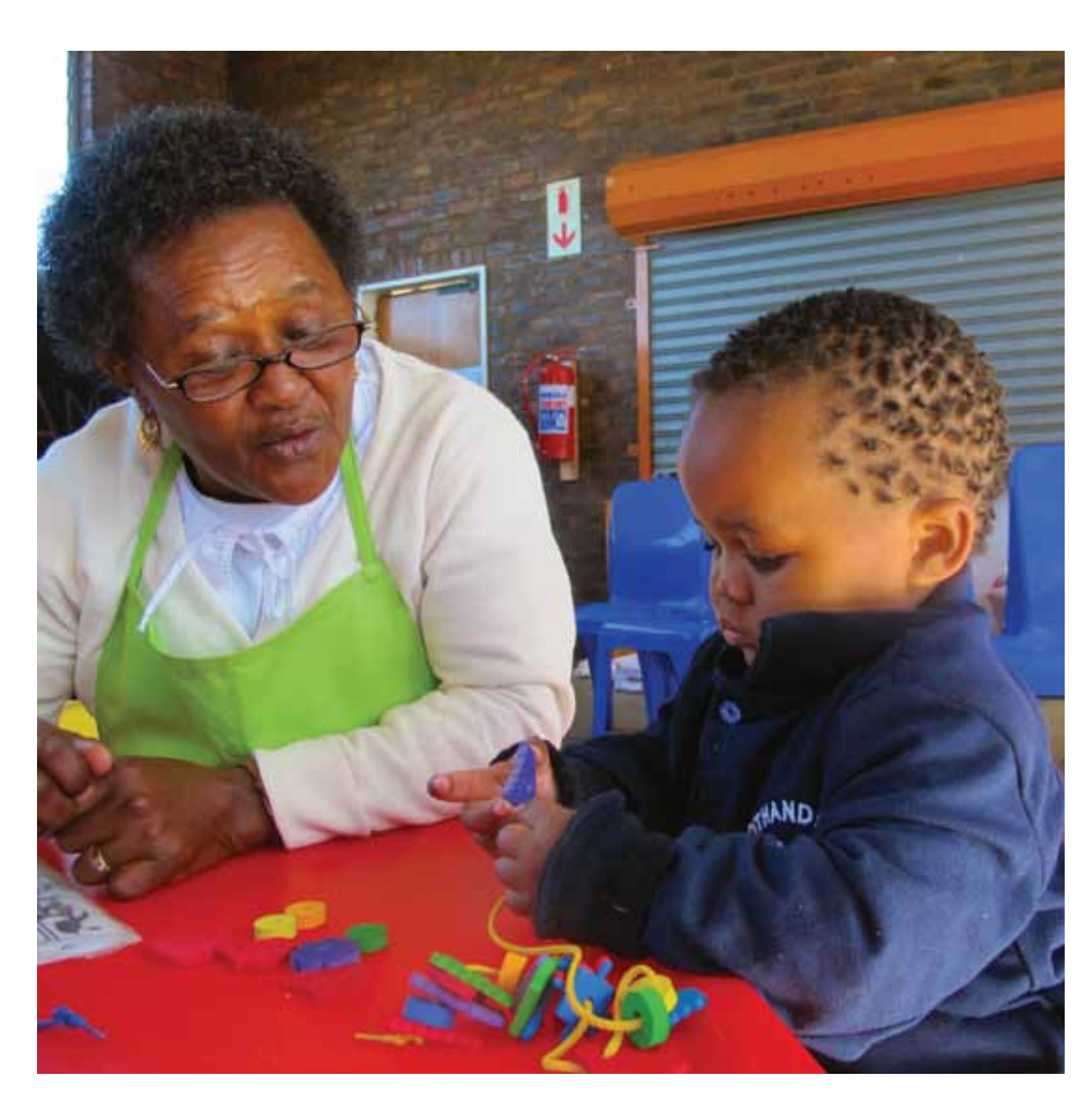
The condition of the physical space and the environment can affect the safety, wellbeing and behaviour of children.

Despite the legislative and systemic constraints to ECD investments, several financing models are available to government that could help address the capital needs of ECD facilities. Possible models include government owning facilities and contracting the operations to community organisations, co-funding facilities (with incentives to meet minimum infrastructure requirements) and a turnkey approach in which NPOs are contracted as technical assistance intermediaries to ECD centres.