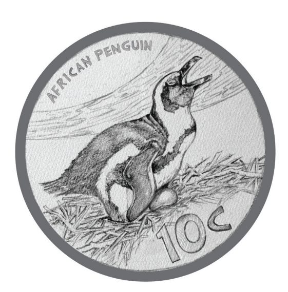
Reverse: 10c (1/2oz, Ag 925 Cu 75)