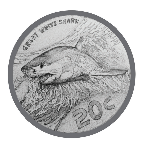
Reverse: 20c (1oz, Ag 925 Cu 75)