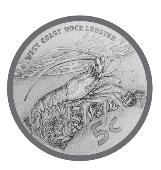
Reverse: 5c (1/4oz, Ag 925 Cu 75)