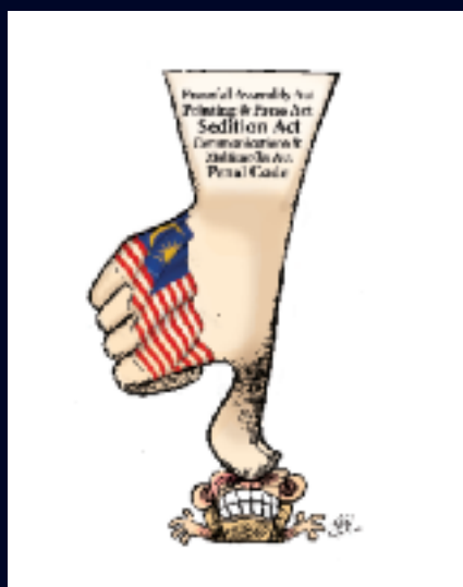
Cartoonist Zunar's depiction of the ongoing use of criminal laws to suppress dissent in Malaysia.

Human Rights Watch calls on the Malaysian government to drop all pending charges and investigations against those who are being prosecuted for the exercise of their freedom of speech or their right to participate in peaceful assemblies, halt the abuse of the legal process to harass and detain critics, and amend or repeal relevant laws to bring them into line with international human rights standards.