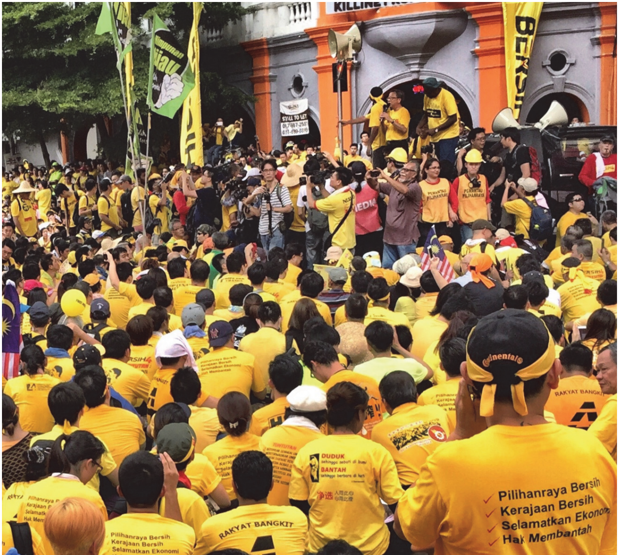
Demonstrators in Kuala Lumpur listen to a speech on the street while wearing yellow Bersih 4 t-shirts printed with the movement's key demands - clean elections, clean government, save our economy, and right to dissent - on August 29, 2015, the day after the Ministry of Home Affairs used the Printing Presses and Publications Act to declare the shirts and other Bersih branded items illegal.