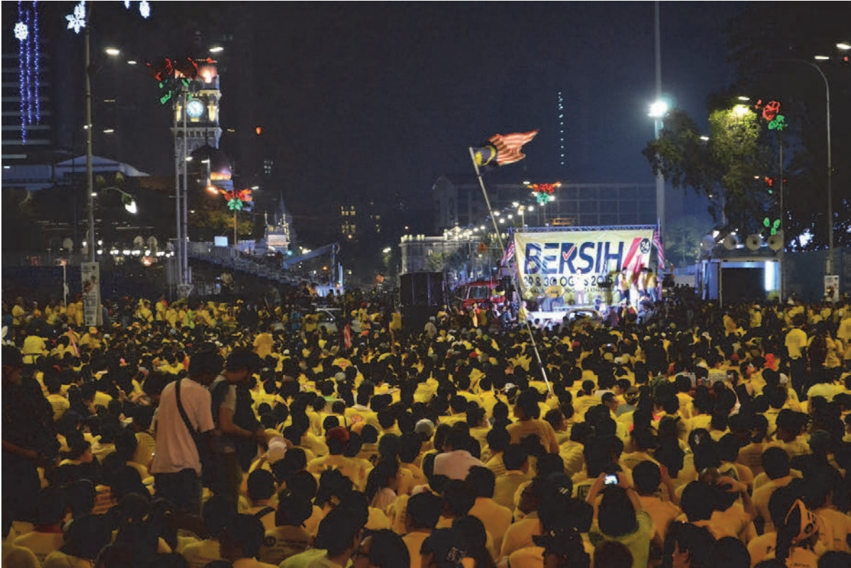
Demonstrators gather to listen to speakers at the main stage during the second night of the two day, 34 hour long Bersih 4 rally in front of one of the entrances to Dataran Merdeka, in Kuala Lumpur on August 30, 2015.