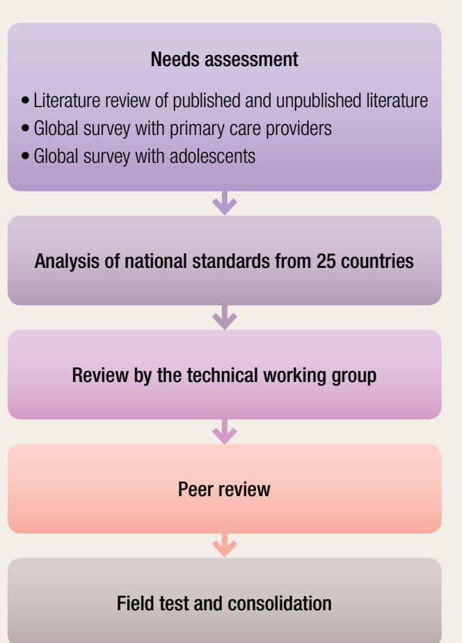
Fig. 1. The process for development of the global standards for quality health-care services for adolescents

WHO developed the global standards based on the needs assessment, which was informed by the literature review and online surveys, in conjunction with the analysis of 26 national standards from 25 countries: Bangladesh, Bhutan, Burkina Faso, Congo, Ethiopia, Ghana, India, Indonesia, Kyrgyzstan, Lesotho, Malawi, Mongolia, Myanmar, Nicaragua, Philippines, Republic of Moldova, South Africa, Sri Lanka, Tajikistan, Thailand, Ukraine, United Kingdom (England, Scotland), United Republic of Tanzania, Viet Nam, and Zambia. The analysis of national standards identified the most common standards1<sup>1</sup> and their criteria,<sup>2</sup> which were then reviewed against the findings of the literature review and global surveys. Actions from