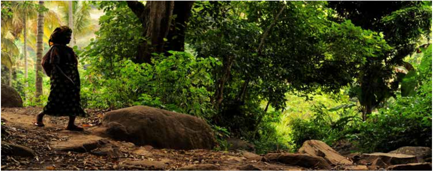
A woman crossing one of several streams which feed an irrigation canal used for climate-smart agriculture in Tanzania.

Food and Agriculture Organization of the United Nations