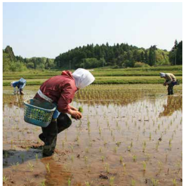
Sustainable Satoyama–Satoumi landscape management in Japan builds resilience to climate change.

emission of greenhouse gases from agriculture, enhance carbon sequestration and build resilience to climate change.