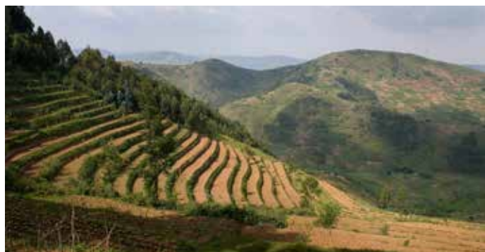
A view of terraced hills, which help soils retain water and prevent erosion.