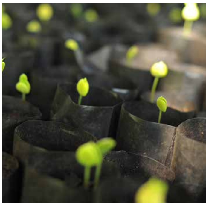
Moringa seedlings at a tree nursery. The moringa tree can play an important role in mitigating climate change and increasing the incomes of poor farmers in Africa.

Climate change represents a serious threat to global food security, not least because of its effects on soils. Changes in temperature and rainfall patterns can have a great impact on the organic matter and processes that take place in our soils, as well as the plants and crops that grow from them. In order to meet the related challenges of global food security and climate change, agriculture and land management practices must undergo fundamental transformations. Improved agriculture and soil management practices that increase soil organic carbon, such as agro-ecology, organic farming, conservation agriculture and agroforestry, bring multiple benefits. They produce fertile soils that are rich in organic matter (carbon), keep soil surfaces vegetated, require fewer chemical inputs, and promote crop rotations and biodiversity. These soils are also less susceptible to erosion and desertification, and will maintain vital ecosystem services such as the hydrological and nutrient cycles, which are essential to maintaining and increasing food production. FAO also promotes a unified approach, known as Climate-Smart Agriculture (CSA), to develop the technical, policy and investment conditions that support its member countries in achieving food security under climate change. CSA practices sustainably increase productivity and resilience to climate change (adaptation), while reducing and removing greenhouse gases whenever possible (mitigation).