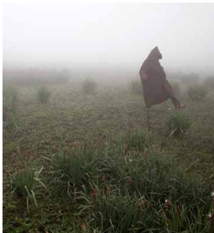
A villager walking through a peat bog in Tunisia.