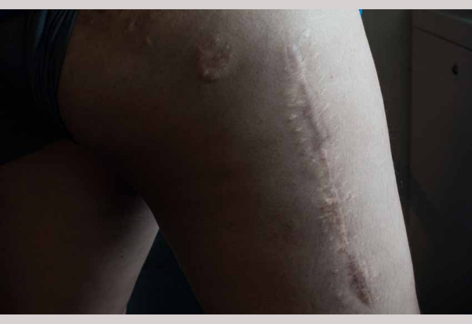
Man shows scars from bullet wounds from gang attack that prompted him to flee to the United States. He is now back in San Pedro Sula after having been deported.

forcibly recruiting a family's young son. Others fled abusive domestic partners or violence related to sexual orientation, both grounds for asylum under US law.