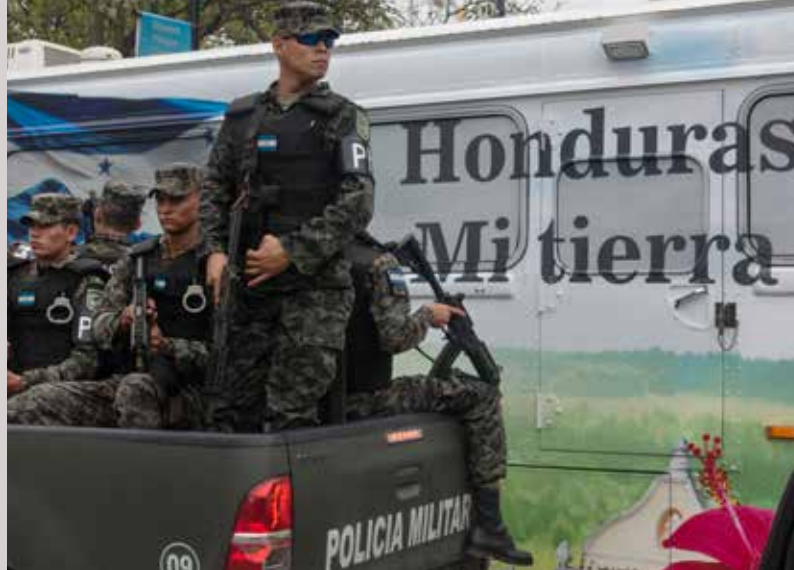
Honduran military police beside a bus with "Honduras is my land" painted on the side in downtown San Pedro Sula.

In the past two decades, US laws and policies have become less responsive to the risks faced by arriving migrants seeking asylum from persecution. In 1996, and subsequently in 2006, the US government severely undermined the system for identifying asylum seekers through the establishment and expansion of expedited removal. The flaws of that approach are readily apparent today at the US-Mexico border.