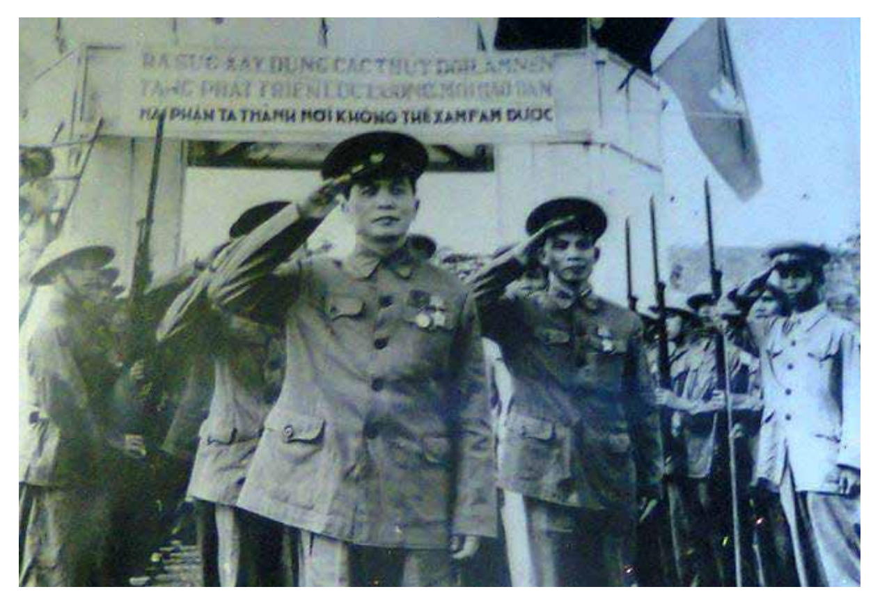
Grand General Giap in his pomp, 1965.

As the veterans fade away, Dien Bien Phu is a battle most Vietnamese have only read about in history books. The town boasts a respectable museum to the conflict across the road from one of four cemeteries for Vietnamese (French soldiers who fell in the Indochina conflict were exhumed and repatriated in 1982<sup>1</sup>) and the French stronghold of Eliane 2 is maintained as a museum along with their command post and a nearby 'informal' French memorial, while a 'socialist realist' sculpture was built atop the town centre for the battle's 50th anniversary.