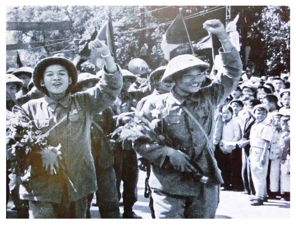
The Viet Minh's 308th Division enter Hanoi, 9 October 1954.

On 9 October 1954, elements of the Viet Minh's (abbreviated from Việt Nam Độc Lập Động Minh Hội , or 'League for the Independence of Vietnam') 308th Division, which had fought and won at Dien Bien Phu, entered Hanoi as liberators.