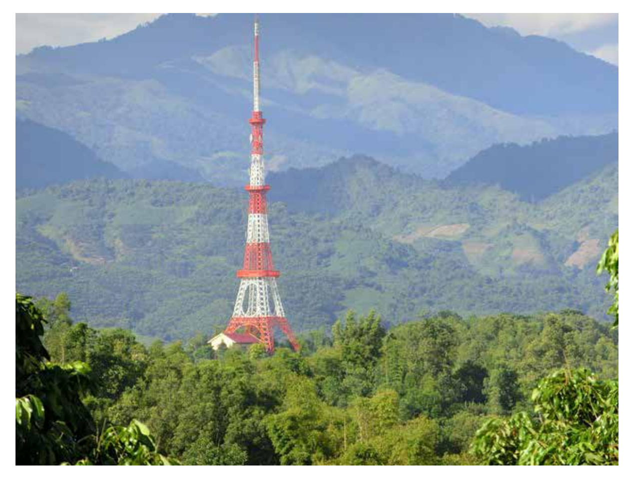
Last laugh in Dien Bien Phu?

Drivers of growth are not the problem in Iraq – it receives $90 billion in oil revenue annually from an estimated production of 2.6 million barrels per day. The country has 115 billion barrels of proven oil reserves, the fifth-largest in the world. Indeed, the fact that ISIS is said to be 'making millions' out of stolen and smuggled oil sold principally to Iraqis and to Turkey paradoxically illustrates this point.<sup>21</sup> While there are longer-term challenges in the Iraqi economy, such as to diversify (oil accounts for 97 per cent of exports), the principal short-term problem with this wealth is one of rent-seeking and a failure of redistribution:<sup>22</sup> Iraq is less Norway than Nigeria in this regard.