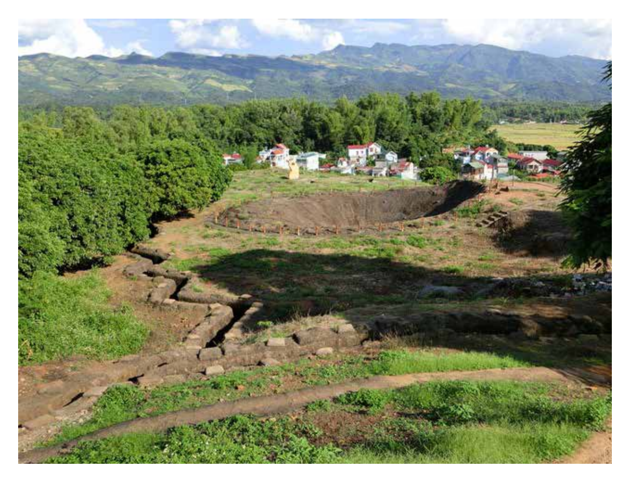
Eliane 2 fell on the battle's second last day – the crater is the result of a 1 000kg mine laid by the Vietnamese.

French casualties totalled over 2 200 dead, 5 600 wounded and 11 721 taken prisoner, of which just 3 390 were repatriated months later. Bernard Fall, author of the definitive account of the battle Hell in a Very Small Place , wrote that the 40-day forced march to POW camps undertaken by French prisoners from Dien Bien Phu 'caused more losses than any single battle of the whole Indo-China war'.<sup>7</sup> Viet Minh casualties are estimated at 8 000 dead and 12 000 wounded – depending on whose version to accept – with, like their French foe, many of the fighters swallowed up forever by the soggy ground where they fell.