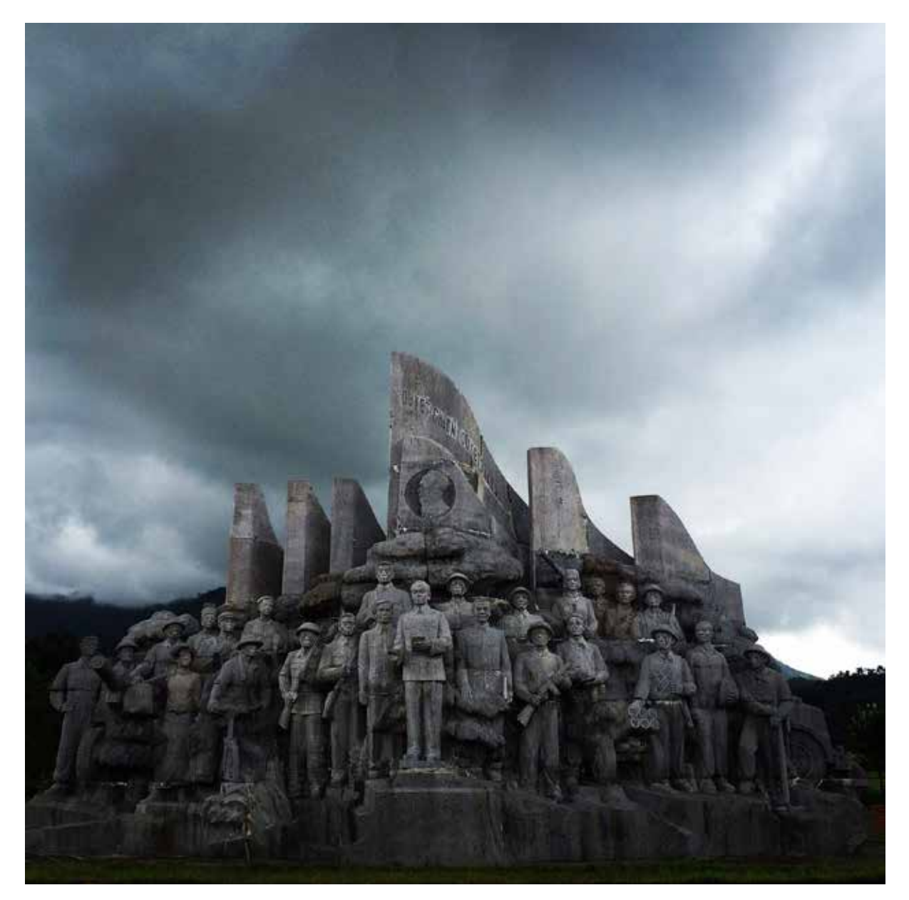
The memorial to Giap en route to his HQ, 35kms north of Dien Bien Phu.

Giap's capacity to conduct resupply, especially of artillery ammunition, and Colonel de Castries' reliance on resupply from the air reminds us that war is more often a match of logistics than of sheer firepower. The latter can only exist with the former. The reliefs on the monuments en route to Giap's remote mountain headquarters 35kms north of Dien Bien Phu depict the heroic scenes of moving guns and supplies. Bicycles, strengthened with bamboo, were game-changers, increasing six-fold the load each soldier could move, up to 300kgs.<sup>13</sup> It is said that Giap kept a chart next to his desk in his thatched hut recording supply deliveries rather than casualties.<sup>14</sup>