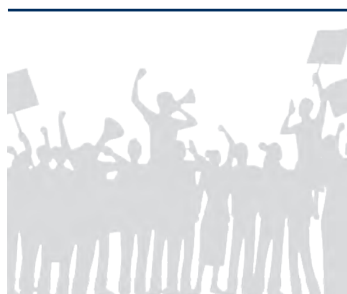
BOZIZÉ LED AN ARMED REVOLT AGAINST PATASSÉ, AND 10 YEARS LATER HE HIMSELF WAS TOPPLED BY A REBEL GROUPING CALLED SÉLÉKA

The track records of the CAR's leaders have been marred by corruption, inefficiency, nepotism and violence, leaving the country at the bottom of human development rankings. As a result of successive coups and counter-coups, regional and ethnic favouritism, and large-scale corruption, the CAR today has few functional