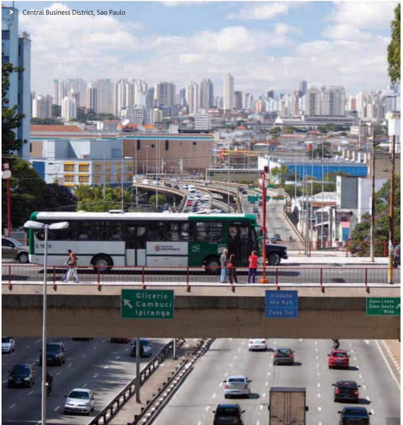
➤ Central Business District, Sao Paulo