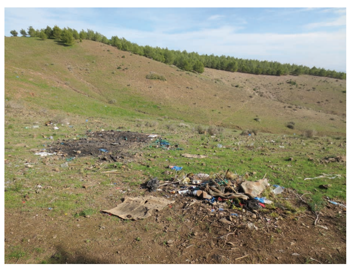
Two tents destroyed by Moroccan security forces at an unofficial migrant camp outside of Selouane, near Nador. © 2012 Human Rights Watch

Human Rights Watch observed the remains of several makeshift shelters and piles of belongings that had been destroyed by fire. Migrants told Human Rights Watch that the police had burned the shelters and belongings.