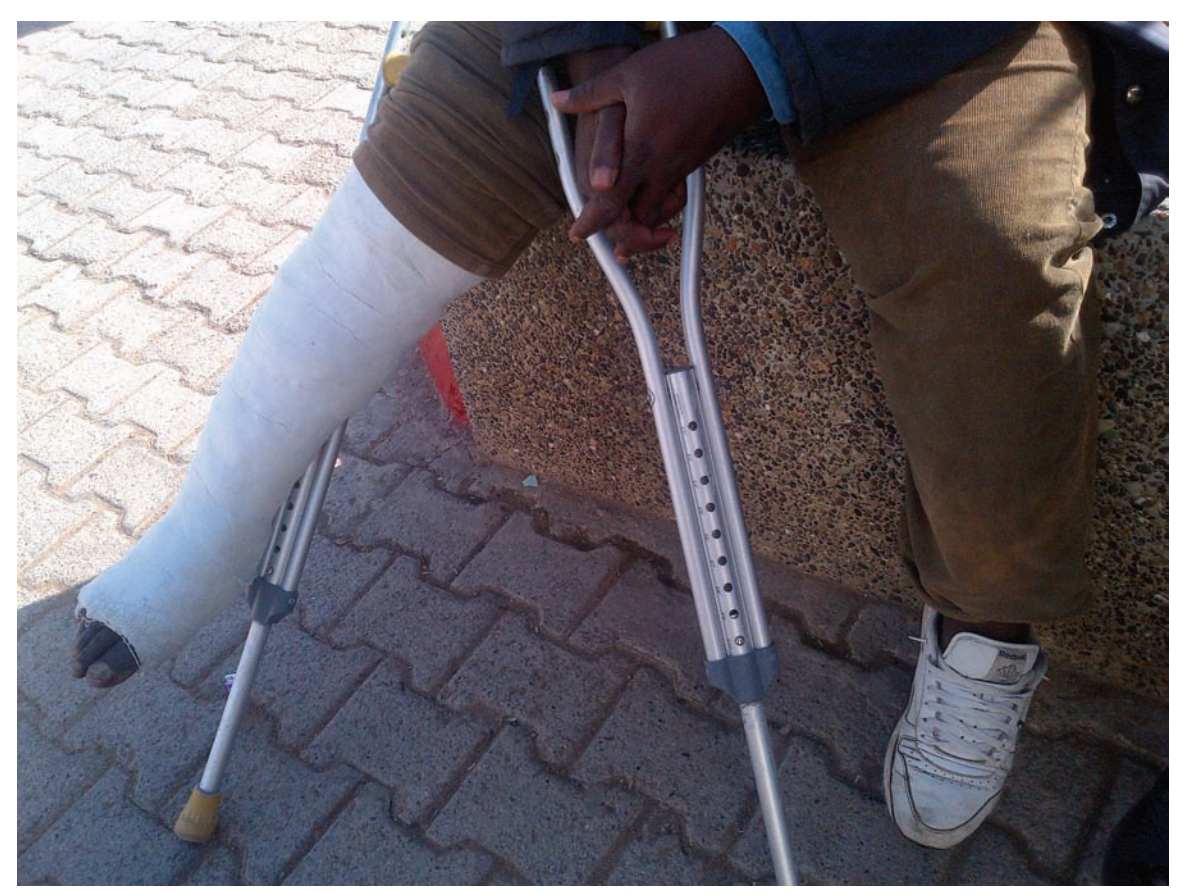
A migrant from Chad at El Hassani hospital in Nador who told Human Rights Watch that Moroccan security forces broke his leg by hitting him with a rod.

Gourougou rising on the Moroccan side of the fence. The second enclave, Ceuta, has two fences and a similar infrastructure.