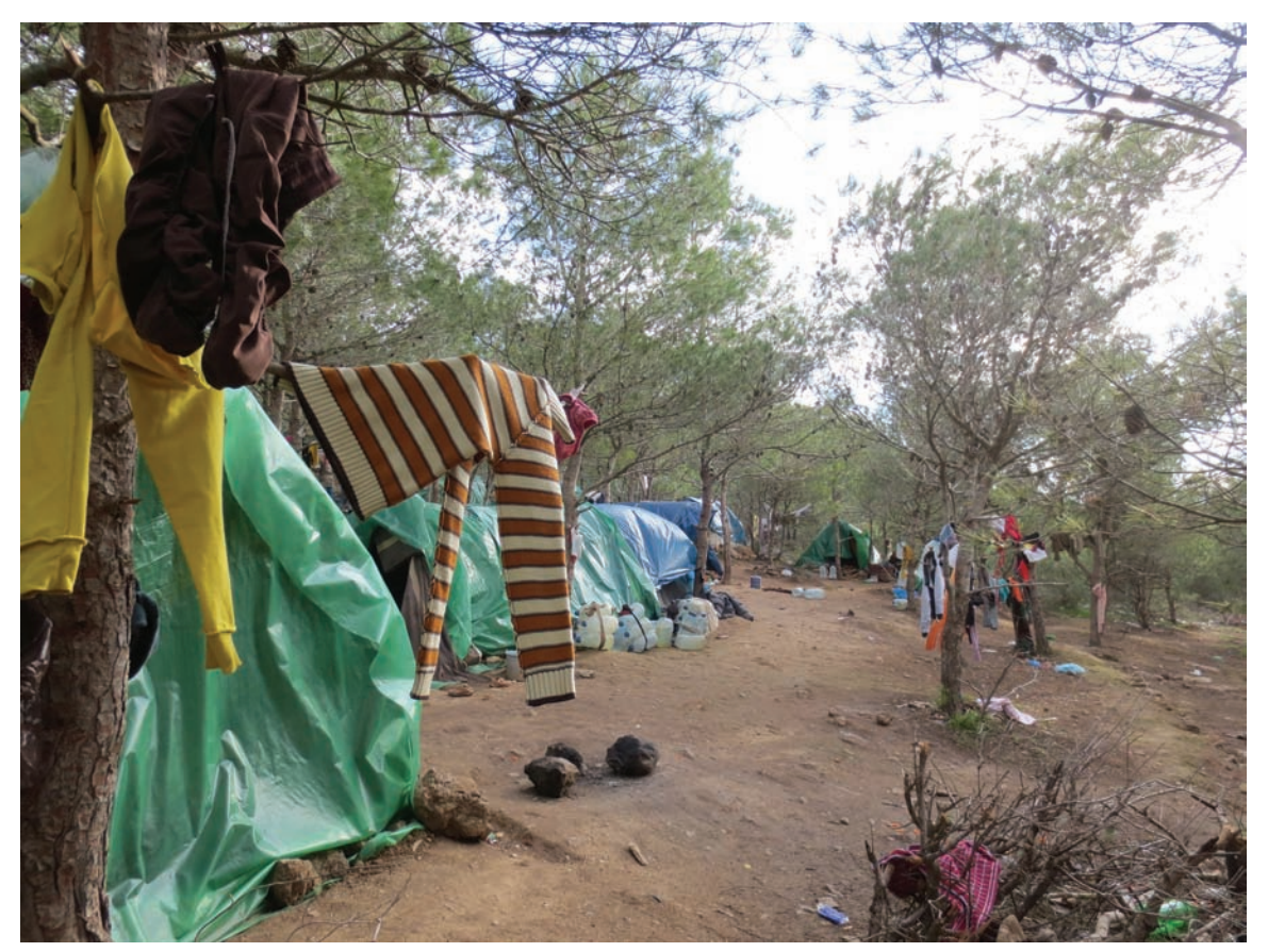
An unofficial migrant camp outside of the town of Nador.

In all of these sites that Human Rights Watch visited, migrants live in tents improvised from sticks, branches, and plastic tarps. The makeshift shelters are often cramped, housing several families or large groups of unrelated individuals.