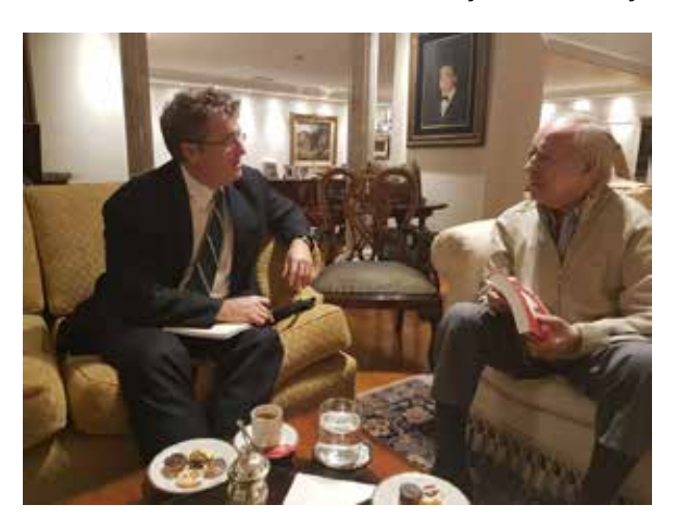
Carlos Menem, President of Argentina: 1989-99

Despite increasing physical infirmity, Menem is as clear today as he was then about the path that Argentina needed to follow. He sees no contradiction between Perónism and these reforms or, for that matter, democracy. 'It is not possible,' he states, 'to have development without democracy. We have had military rulers. They are good at giving orders, but not to govern. They have been failures, in Argentina and elsewhere, such as now in Venezuela, which should be a very rich country.'