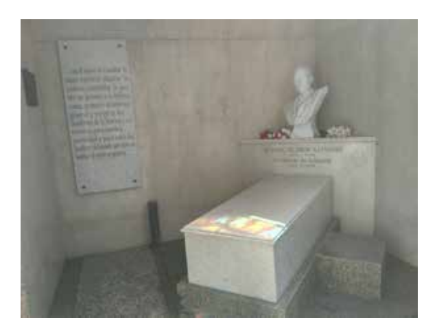
The tomb of Raul Alfonsin in Recoleta along with the words from the Constitution: '... in order to constitute the national union, to strengthen justice, to consolidate inner peace, to provide for common defense, to promote the general welfare, and to ensure the benefits of freedom, for us, for our posterity, and for all men of the world that want to inhabit the Argentine soil ....'

without markets and socialism without plans'. The root of this was uncontrolled fiscal spending which lay in political promises and expectations. When the government proved unable to fund its spending through tax and was unable to raise more debt, Cavallo notes, printing money is a 'subtle way to collect a kind of tax that does not need approval by the legislature – the inflation tax.' This effectively imposes a tax on savings and wages, the unfairest tax of all.