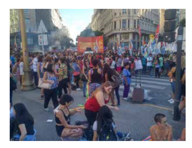
Public protest is a national sport in Argentina; taking responsibility is not.

between politics and labour unions. It is close to the Plaza de Mayo, where Perón was the target of an air attack during the 1955 attempted coup, killing over 300 people.