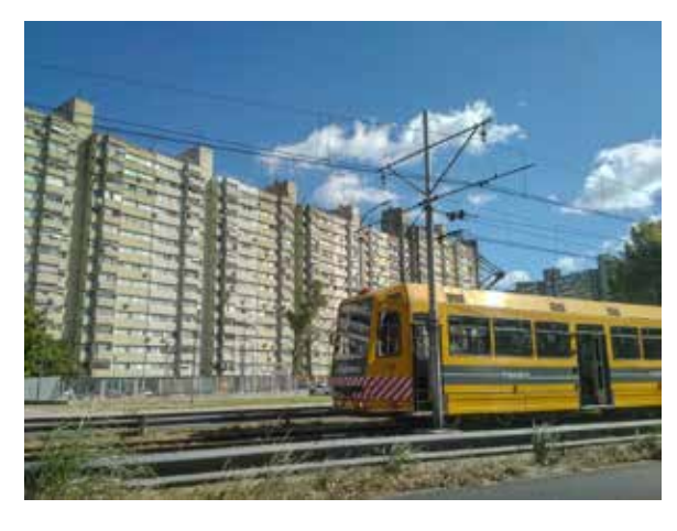
Perónism supplied a heady mix of public goods, including mass housing, jobs through import substitution, and ego national projects from architecture to airlines – until the money ran out.

Not only did Perónism advocate interventionism, protectionism, and high levels of state spending, but these policies ensured political support of the masses through subsidies and preferences. For example, to ensure his 1946 election victory, he persuaded the president to nationalise the Central Bank and extend Christmas bonuses. Such spendthrift redistribution, while politically expedient, has served repeatedly to destroy capital accumulation, while attempting to baulk the inevitable reality of internal budget constraints and the underpinnings of global competitiveness.