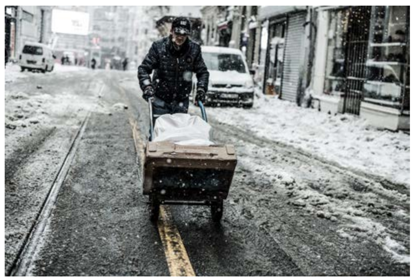
Syrian refugee working in Istanbul, Turkey. January 2017.

In comparison to the funds pledged and or committed to Turkey at the London Conference and through the EU-initiated Facility for Refugees in Turkey, Turkey has spent approximately $25bn of its own fiscal resources on the refugee response.42