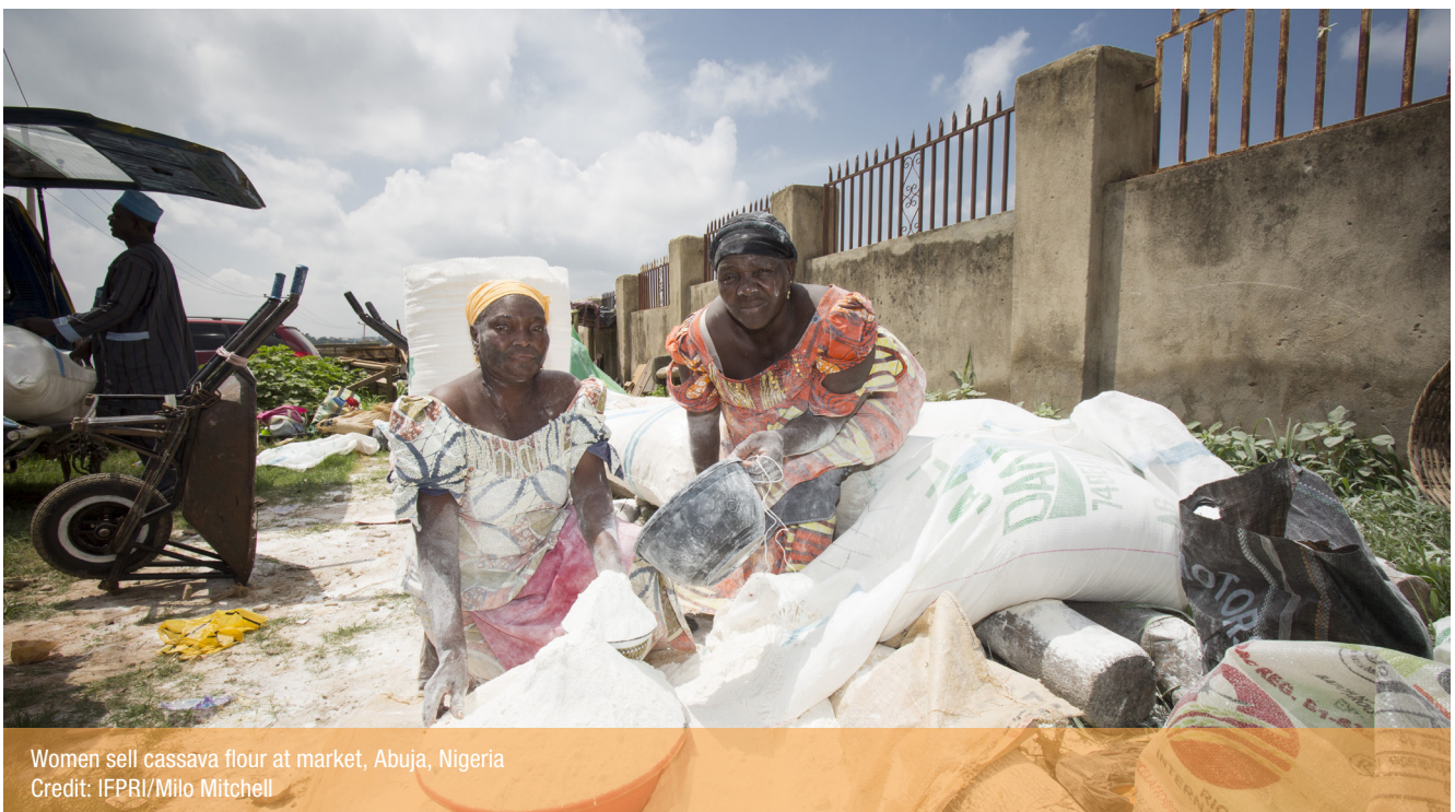
Women sell cassava flour at market, Abuja, Nigeria