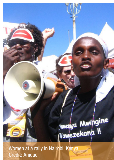
Women at a rally in Nairobi, Kenya

Evidence is also limited on how the expansion of family-friendly policy and women's political participation and leadership are linked – e.g., how childcare programmes have been expanded in ways that are also sensitive to women's needs, what has led to the adoption (and implementation) of laws aimed at protecting domestic workers, how broad-based coalitions to advocate for care can be formed in highly unequal environments and what factors have prompted greater female involvement and influence in politics.